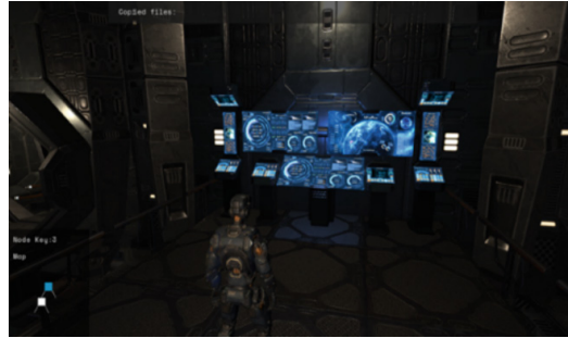
Fig. 1. Screenshot of DS-Hacker 3D – Level 1.