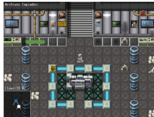
Fig. 2. Screenshot of DS-Hacker 2D – Level 1.

Regarding the learning content, DS-Hacker (2D and 3D) focuses on fundamental concepts of the BST. According to Sedgewick and Wayne [12], a BST is a specific order of a Binary Tree (BT). A BT is a structure made up of objects known as nodes, each of which contains two links that can be null or refer to other nodes. Additionally, each node can be pointed to by just one single node. On the other hand, BST nodes have two additional elements: the comparable key and the associated value. They satisfy the property that “the key in any node is larger than the keys in all nodes in that node’s left subtree and smaller than the keys in all nodes in that node’s right subtree” [12]. Consequently, the learning objectives (LOs) cover two topics: BT and BST. Table 1 presents the LOs.