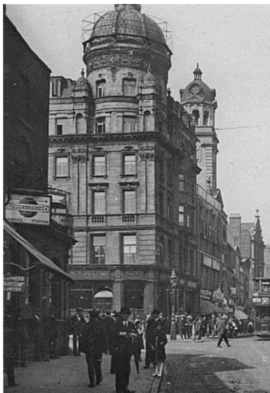
The Angel and Crown was situated at 5, Sebbons Buildings, North side of Islington High Street.

His death certificate reference is: 1890 (Mar Q 1C/16 London City). He was just 29 years old.