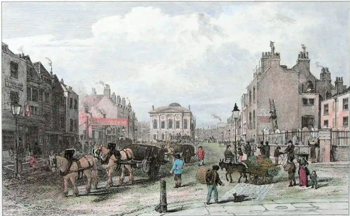
SESSIONS HOUSE . CLERKENWELL GREEN.