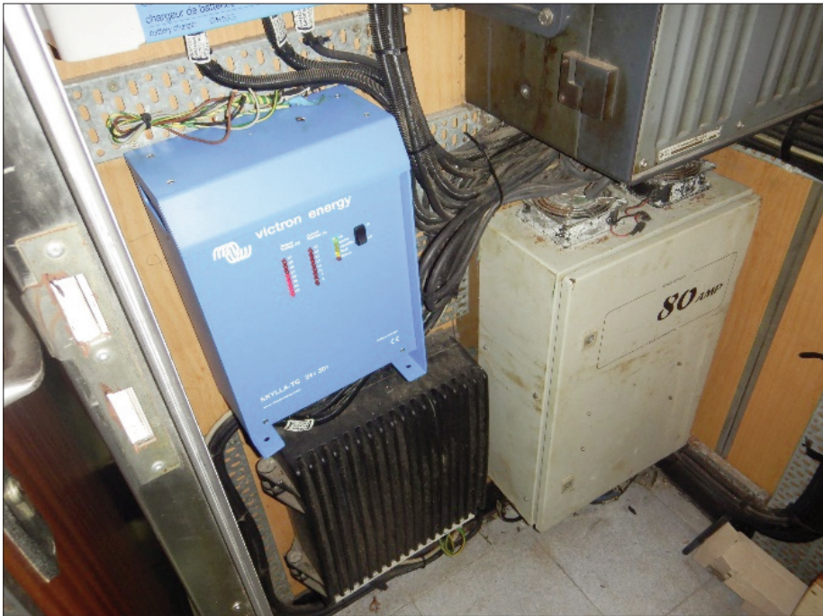
New Battery Charger.