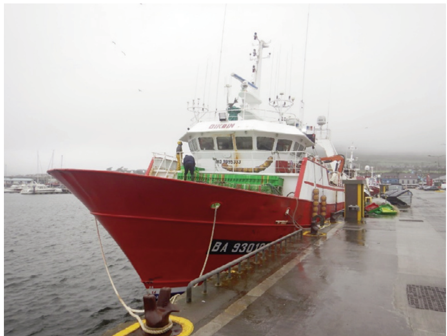
FV Bikain Alongside in Dingle