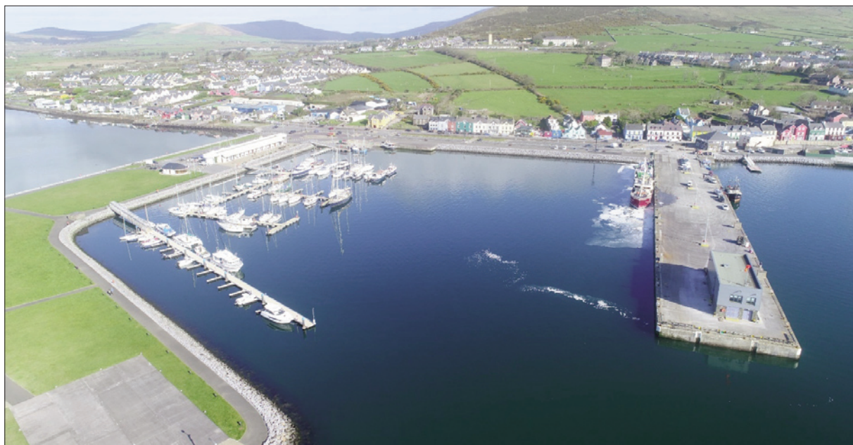
Photograph of the Location from Harbour Camera.