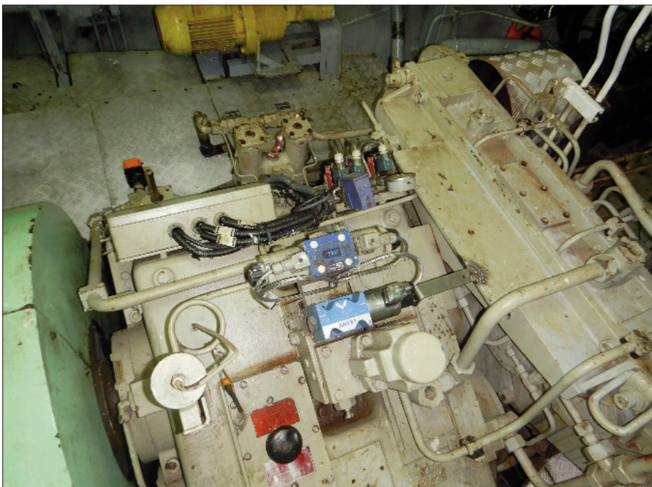
New Solenoid for CPP (blue unit on top).