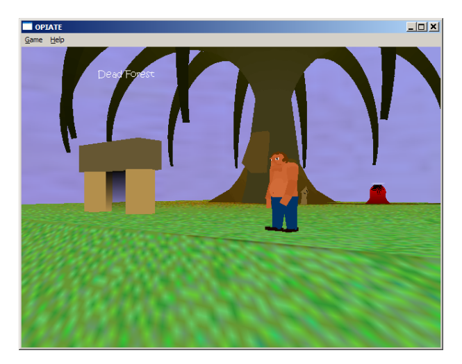
Figure 2: A screenshot of the demo game.

The gameplay in our demonstration game is quite limited, and poses no real challenge to a player. If the player chooses to ignore a puzzle or challenge, then they can simply pursue a different subplot. However, there are only a limited number of puzzles authored, and no real possibility for emergent puzzles in the game. Puzzles are authored as specific problems a character wants solved, or the required use of a certain object to progress. As there are not a large number of locations (22), the player's options are quite limited. There are 28 characters and 18 types of actionobjects, however, so the player's choices primarily lie in their interactions with other characters. Characters can develop desires for certain types of object as a result of a subplot requiring it, but these are not authored puzzles, and play out somewhat artificially, as the desire is not based on any internal drives on the part of the character model. In a more large-scale, fully simulated world, the OPIATE system should perform better, with characters' problems and desires emerging from more fully realised character simulations.