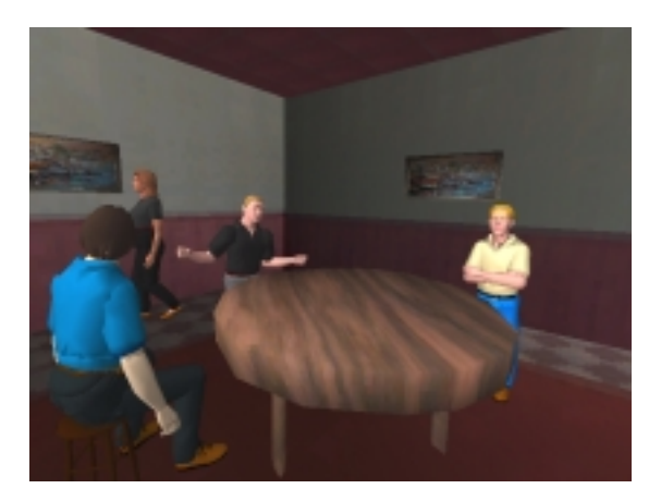
Figure 2: Images show various aspects of a scene created using the ALOHA system with the role passing technique.