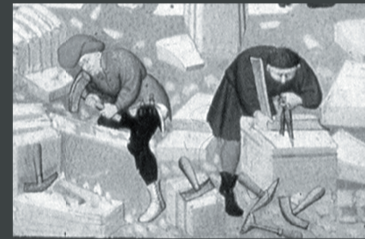
London, British Library, Add. Ms. 1885