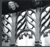
Screen at Carlish Cathedral dating from the tenure of Prior Goughbour in the late fifteenth century