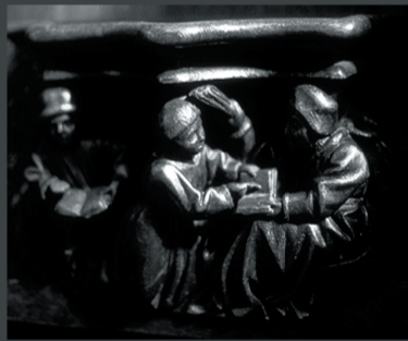
Rouen Cathedral, detail of choir stalls, Britain 1465 and 1469 six hundred pieces of 'bois d'Illande' were imported for their construction-O'Brien in 'Ireland and Aquitaine in the Middle Ages', 1995