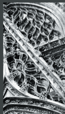
Vézère Abbaye de la Trinité West Facade 1506