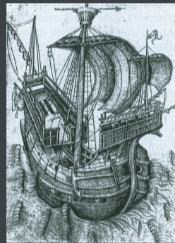
A carrack as draagh by Master W A (c.1465-85), British Museum