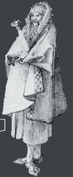
'Thus go the poor of Ireland' draagh in Antwerp by Durer 1521

The tomb niche illustrated to the left is that at Strade Dominican friary, Co. Mayo. Over the past fifty years there have been suggestions that the tracery was inspired by monuments in France, England or even Spain. Analysis of the moulding profiles, however, shows that this is the work of an Irish mason, who is using a standard repertoire of forms inherited from the fourteenth century. The tracery is an unusual synthesis of elements, which may owe debts to France, the Low Countries, and to church furniture executed in wood.