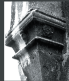
Corbel at Strade Dominican Friary, Co. Mayo