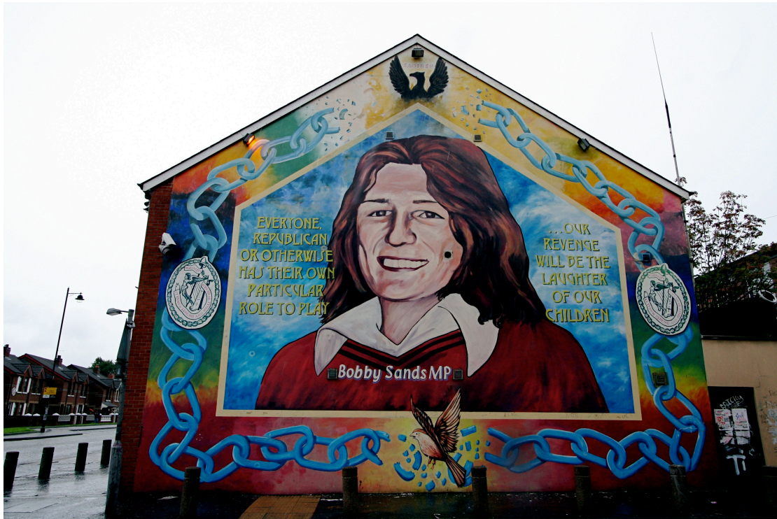
Figure 5. Belfast mural: Bobby Sands MP

There is a certain fragility to a painted mural, especially in a damp climate such as that of Northern Ireland. To persist it must be re-painted. Such murals are ephemeral by their very nature. In the context of Northern Ireland, each mural belonged to a distinct sort of “tribal area” and celebrated a particular event or person. In a sense, the mural served as territorial marker.