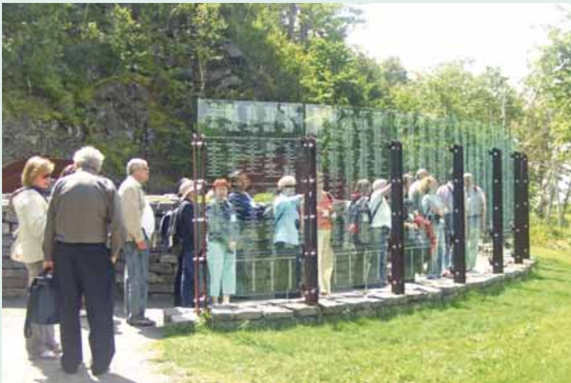
The GENLOC group (among others) at the Grosse Île Memorial, which commemorates the Irish and other immigrants who died on the island, and those who looked after them

My highlight of the week was the GENLOC group visit to Grosse Île on Wednesday 13th August. This small island on the St. Lawrence River, about 45 kilometres from Quebec City, served as a quarantine station from 1832 to 1937, through which ▶