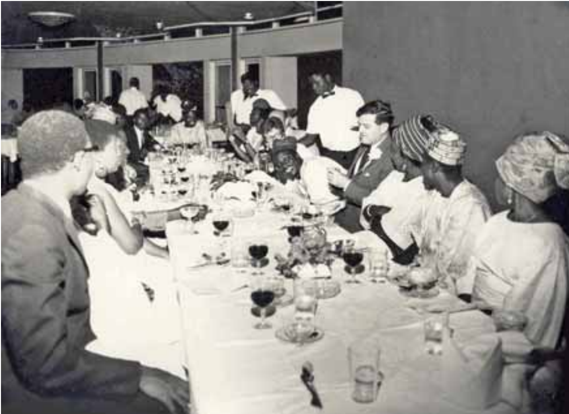
Farewell Party, Accra, 1965

to 1965. The University of Legon was a new university as indeed were all the universities where I worked in Africa. While institutions of higher learning were not new in West Africa, comprehensive university and library systems came into their own between 1950 and 1970. I've written a chapter on this development in Comparative and International Librarianship (Dean 1970).