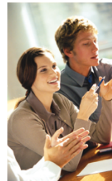
The profile of the intended audience has a significant impact on the framework and content of the support programme

The next element for consideration is the level of requirement for attendance, and whether the programme should be offered as a compulsory or voluntary support mechanism. Experience has shown that the initial introduction of such programmes are embraced more readily by staff if the nature of attendance is voluntary; a compulsory requirement to attend could be introduced at a later stage.