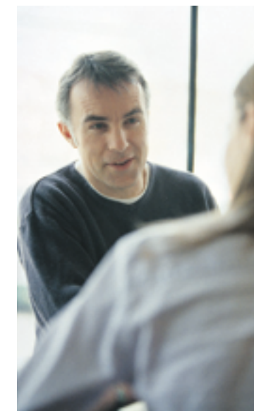
Minimum lecturing content, maximum use of discussion

An agreed division of elements to be developed and piloted in each partner institution was agreed to allow eventual sharing of materials and experience between partners, and joint collaborative initiatives. Added value was a natural consequence of the collaborative nature of the project across so many institutions.