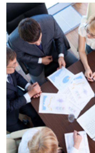
Key supervisor responsibilities should be highlighted in the workshop

As Structured PhD programmes are still relatively new in many institutions, it is important that the general principles governing such programmes in the institution are described, including information on generic and transferrable skills training and advanced discipline-specific modules and their accreditation. Information on the input of graduate