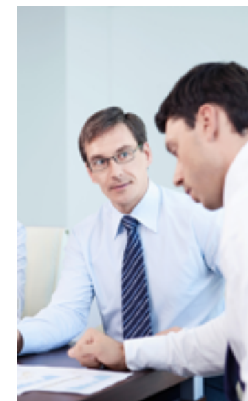
Develop a workshop programme for your institution

This guide is comprised of five additional sections. Section 2 explores the main considerations when developing the workshop programme for your institution, i.e. the audience and delivery methodologies. Section 3 provides details of the five workshop framework devised by the NAIRTL working group including learning outcomes and suggested exercises. Section 4 identifies the benefits of Supervisor development programmes and the recommendations of the NAIRTL working group on how best to support and develop these activities at an institutional and national level. Section 5 is an extensive bibliography of supportive literature of relevance to workshop coordinators, supervisors and postgraduate research students. Section 6 provides a link to an online Virtual Learning Environment which is populated with template workshop programmes, case study examples and similar materials for the development and delivery of your own workshop programme.