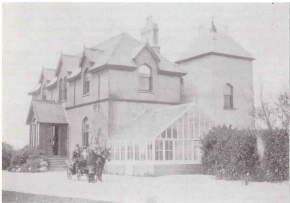
Valentia Observatory in the 1920s

of Kew Observatory and went very smoothly, the only casualty being that one standard thermometer was broken in transit. The station had been supplied with a Richards thermograph and barograph in 1891 in order that records of temperature and pressure would be maintained during the changeover. Only a few days' wind and humidity records were lost.