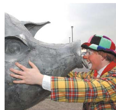
Muc in for Hospice: Clown from Fossett's Circus with giant Muc at Dublin Airport

Our primary sponsor for Muc in for Hospice was the Irish League of Credit Unions, and many credit unions all over the country displayed Muc donation boxes. This fundraiser earned over €70,000 and we are indebted to our sponsors and all who helped.