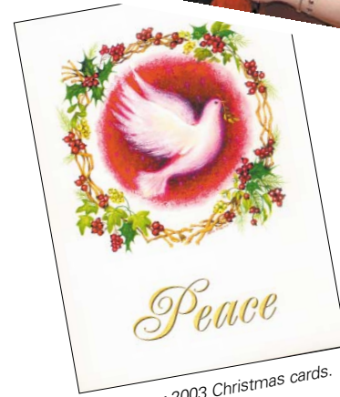
One of our 2003 Christmas cards.