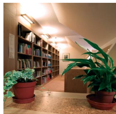
The Thérèse Brady Library

Work continued on creating a database of Irish research on death, dying, bereavement and grief over the past five years. It is hoped to have up to 100 research theses listed when the database is complete.