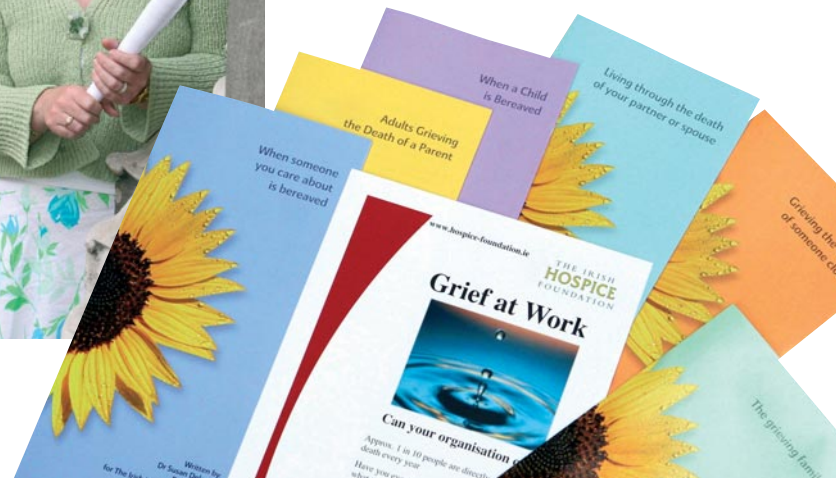
Some of the information on bereavement available from the IHF.

their certificates on 7th April. In October 2006 a further 25 students were enrolled.