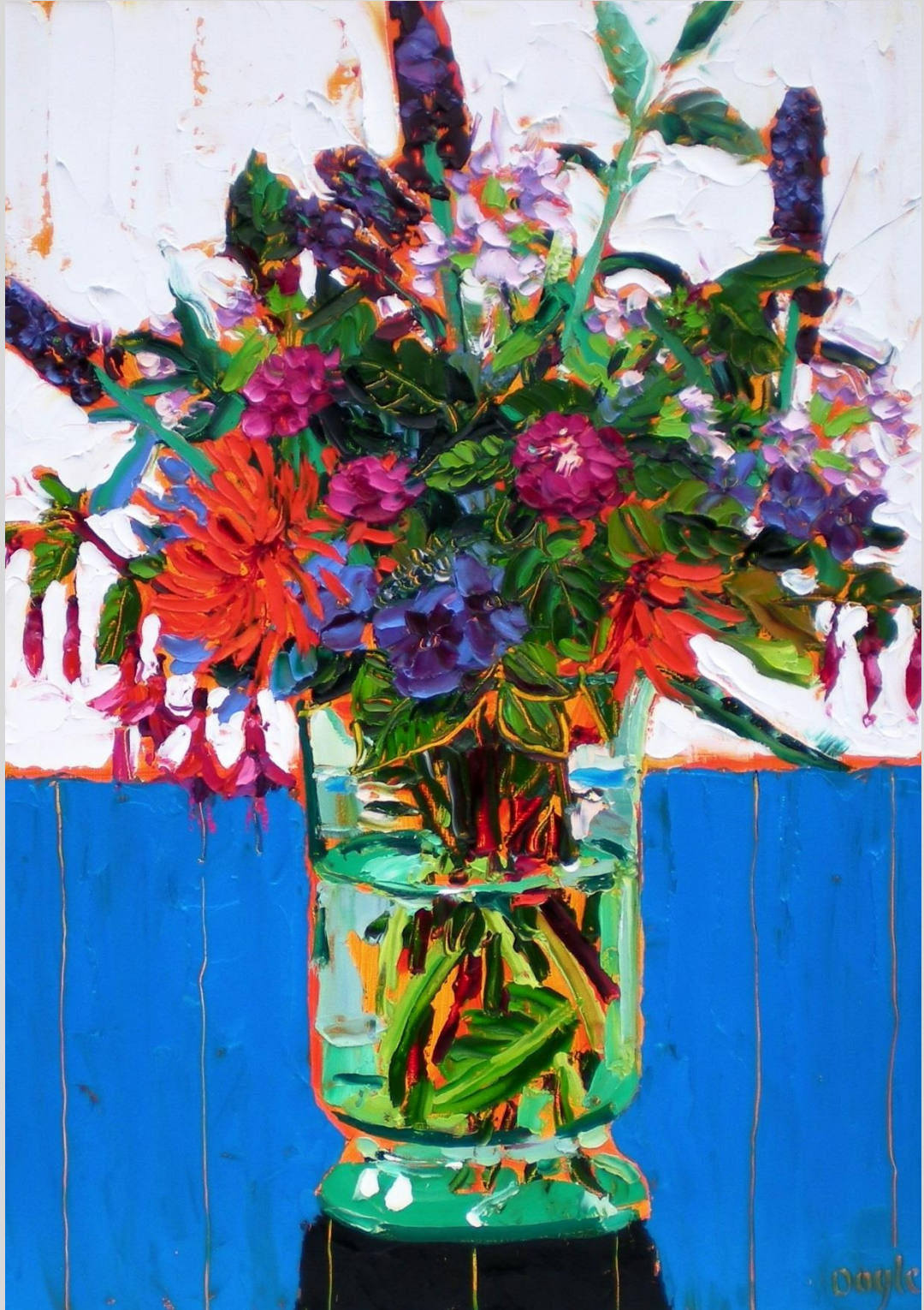
Above: Flowers on blue table 71 x 50 cm Oil on board