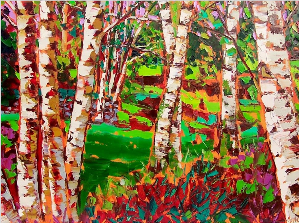
Tigroney birches 91 x 122 cm Oil on canvas