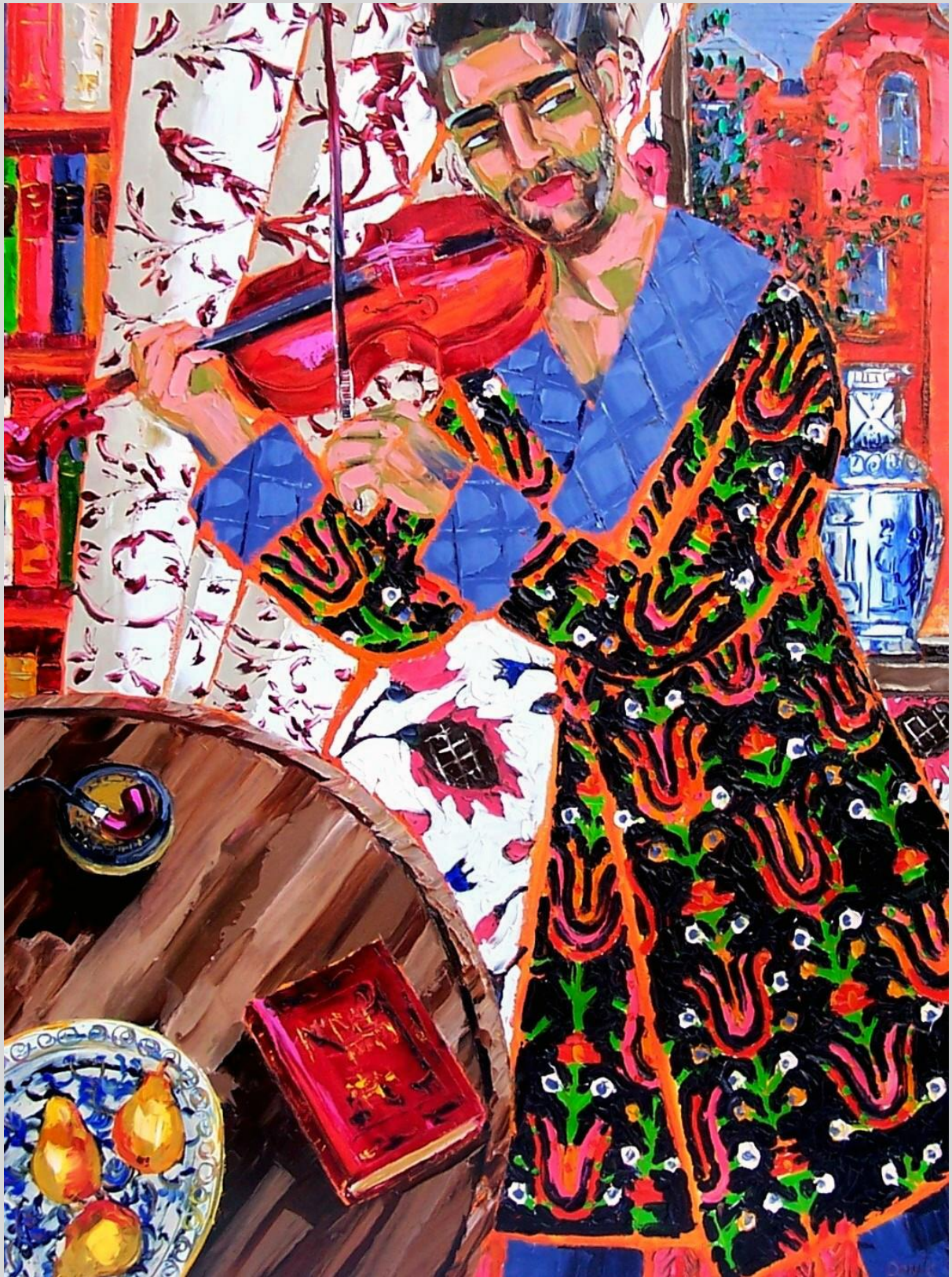
Man with violin 122 x 92 cm Oil on canvas