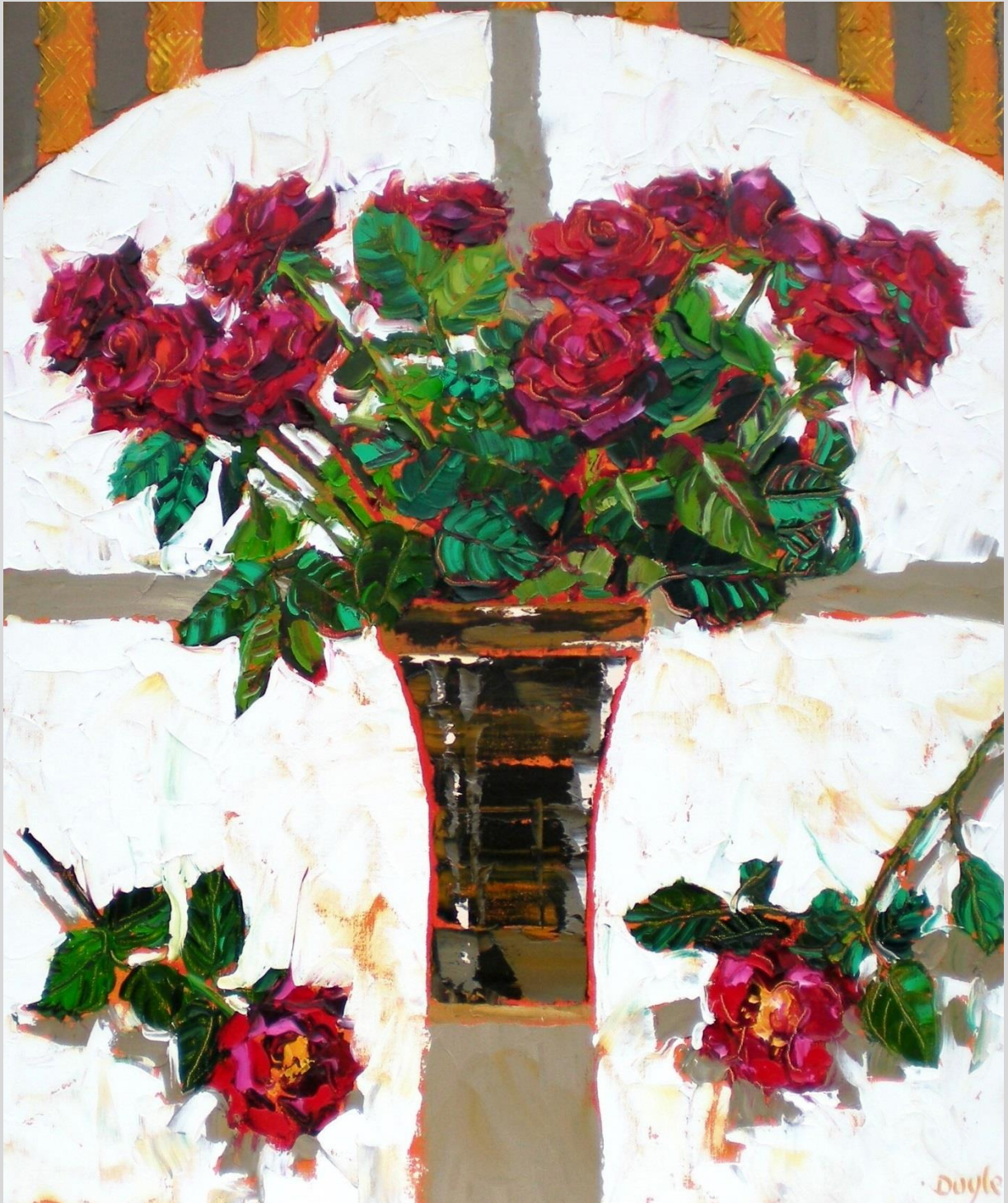
Roses on white cloth 91 x 76 cm Oil on canvas