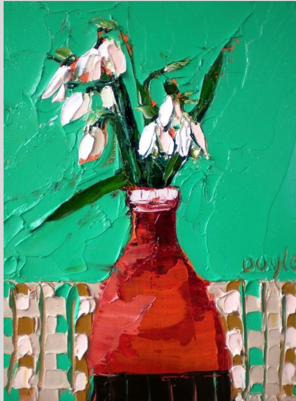
Snowdrops green 20 x 15 cm Oil on board