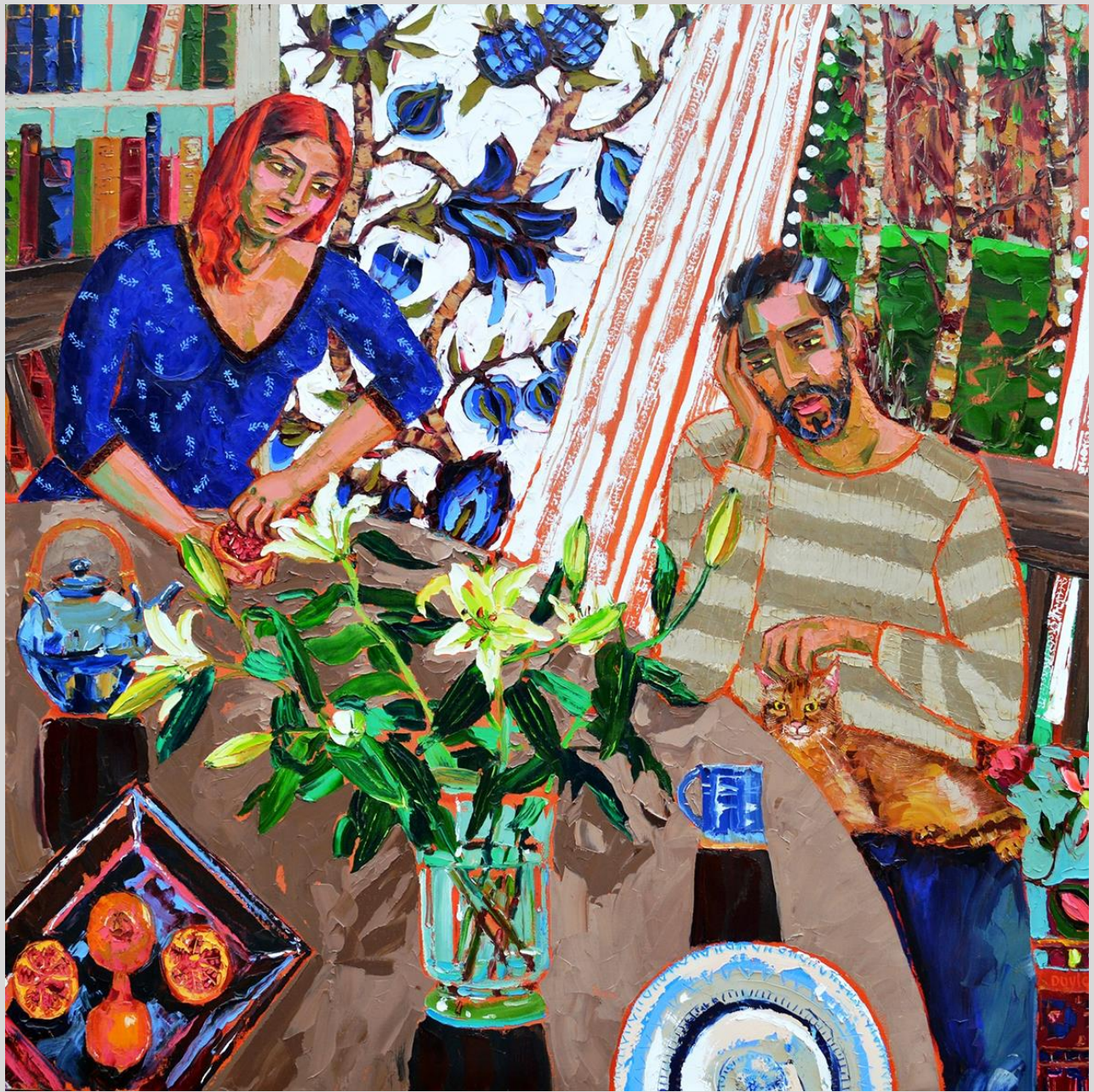
Mr and Mrs Hades 152 x 152 cm Oil on canvas