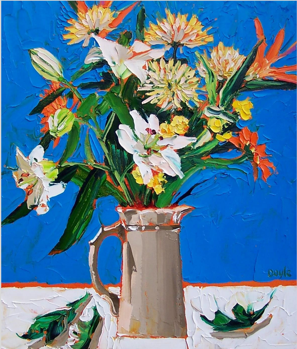
Flowers on white table 71 x 61 cm Oil on canvas