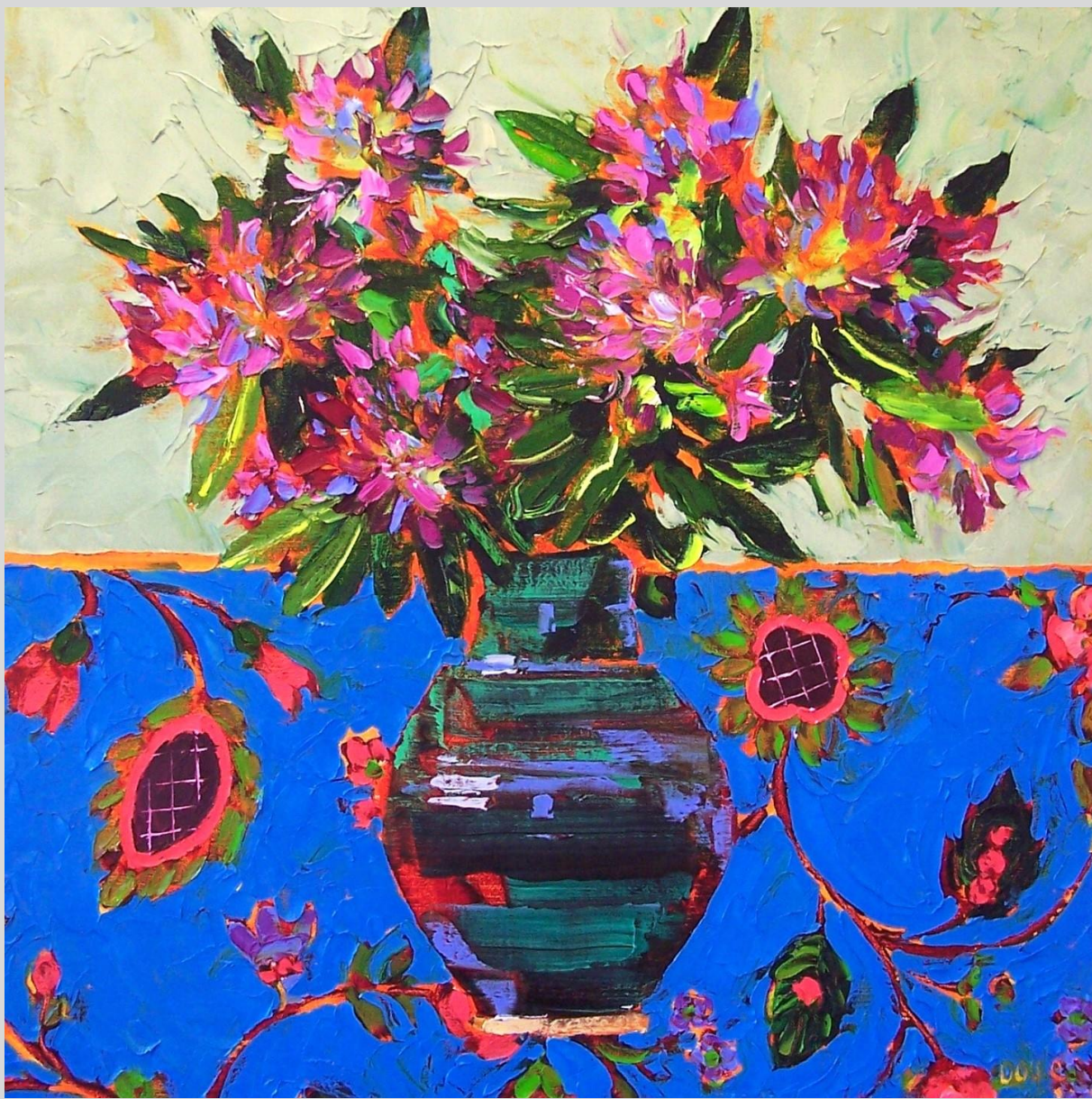
Rhododendrons 71 x 61 cm Oil on canvas