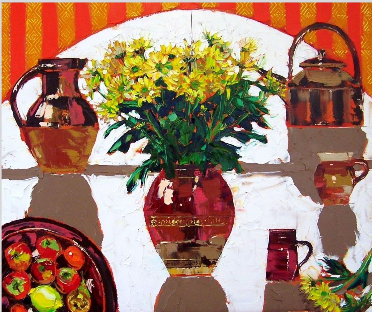
Still life with yellow chrysanthemums 76 x 91 cm Oil on canvas