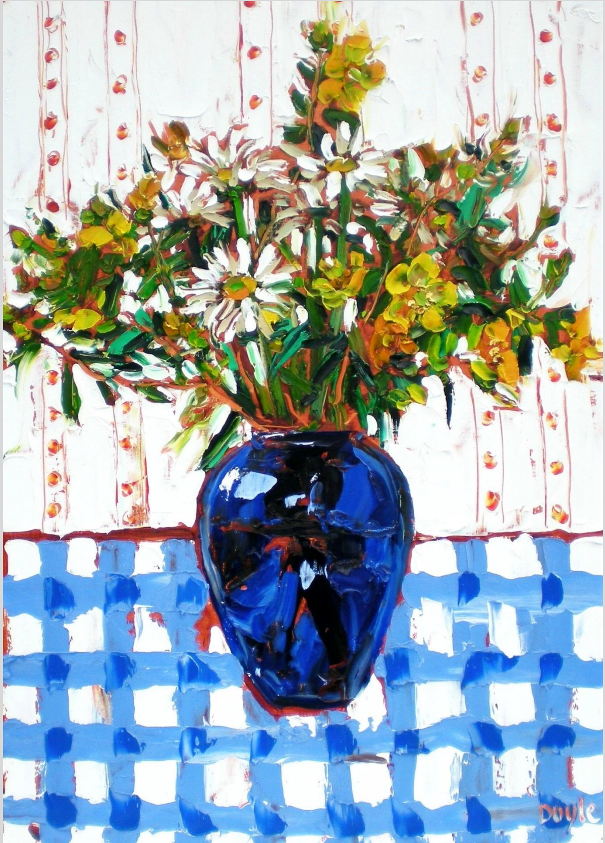
Flowers on blue checked cloth 71 x 50 cm Oil on board