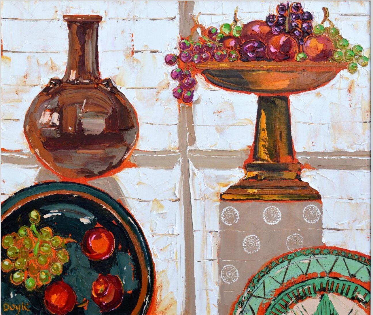
White still life 61 x 71 cm Oil on canvas