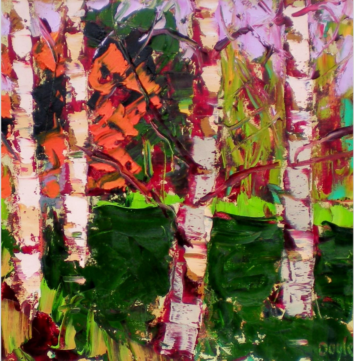
Birches II 46 x 46 cm Oil on canvas