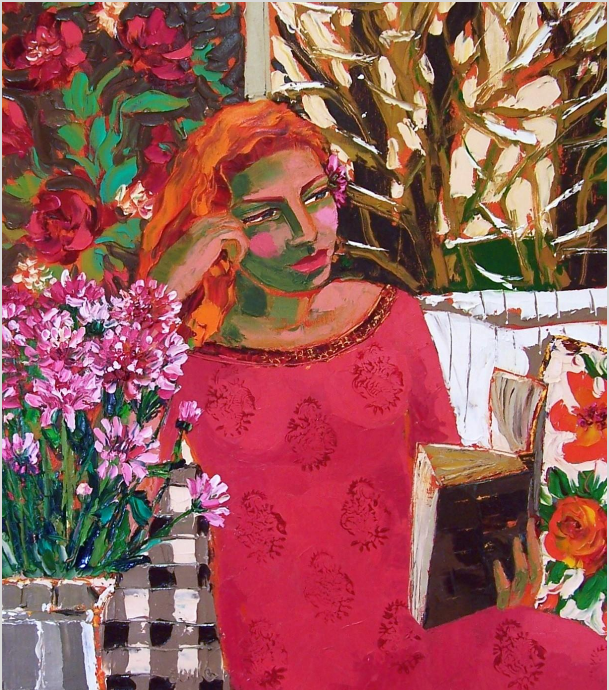
Reading 71 x 61 cm Oil on canvas