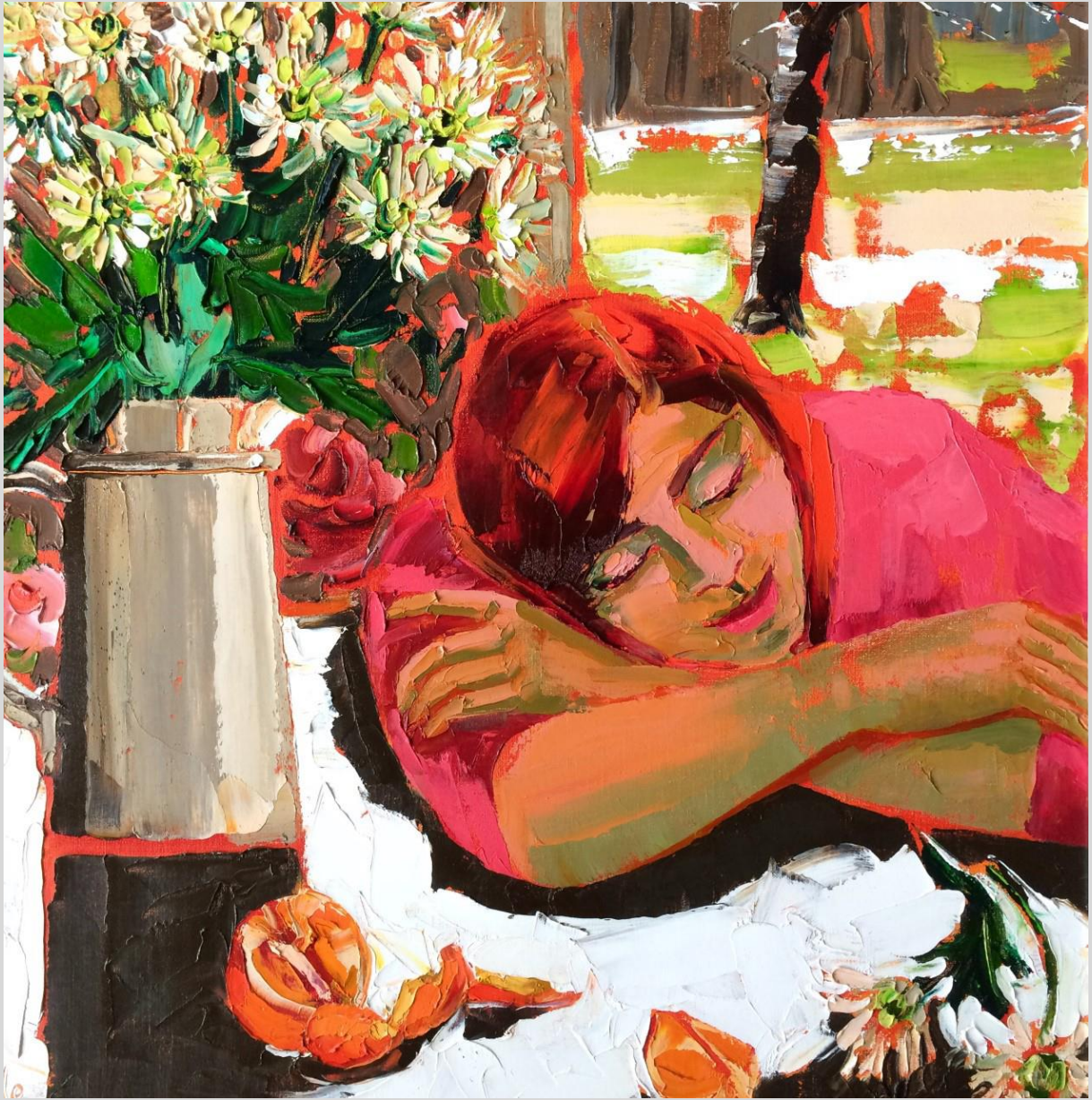
Above: Dreaming of summer 71 x 61 cm Oil on canvas