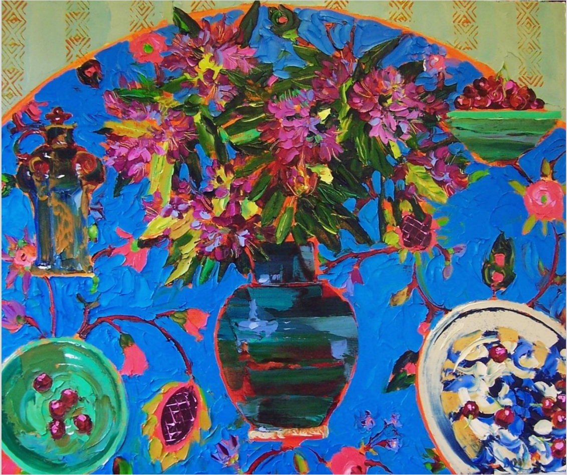
Still life with rhododendrons 76 x 91 cm Oil on canvas