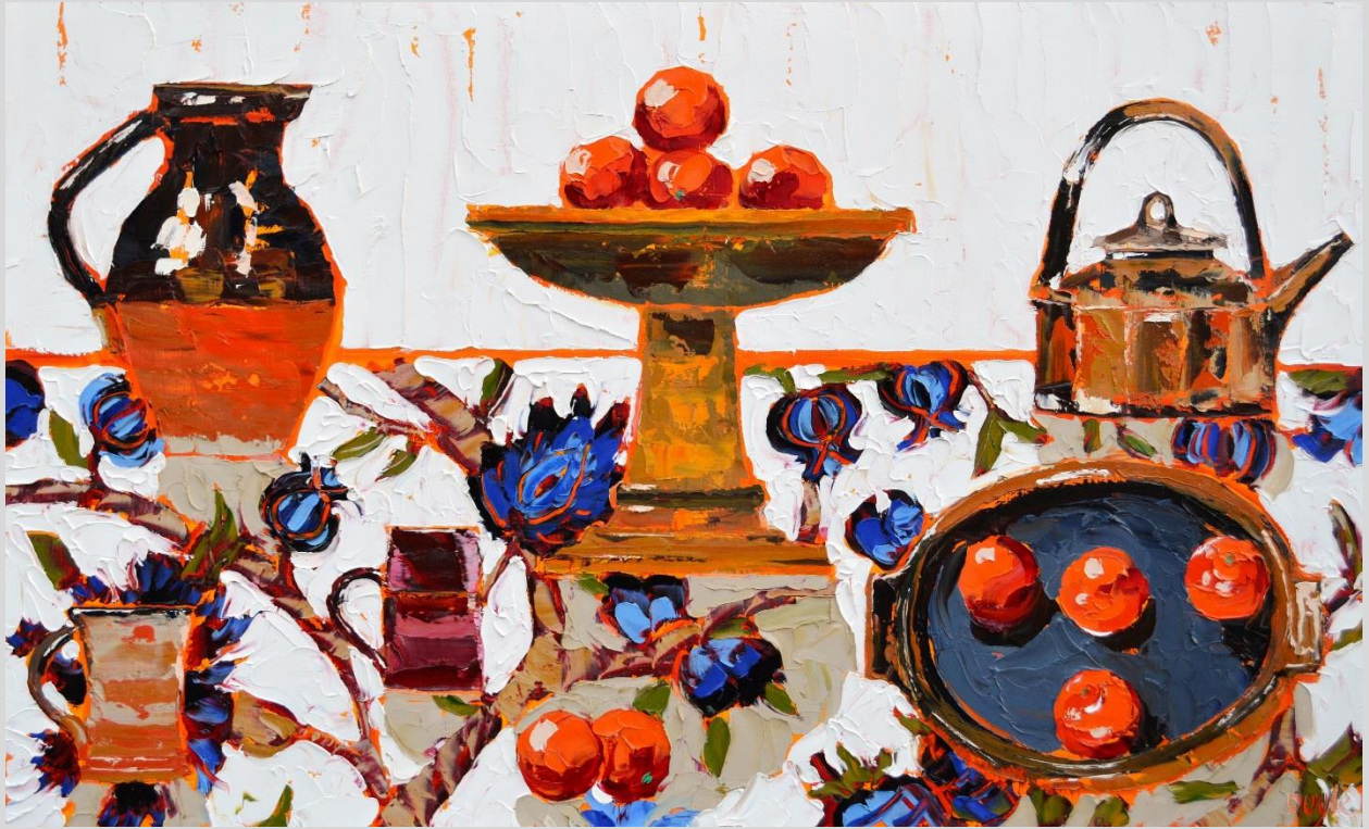
Still life with oranges 61 x 100 cm Oil on board