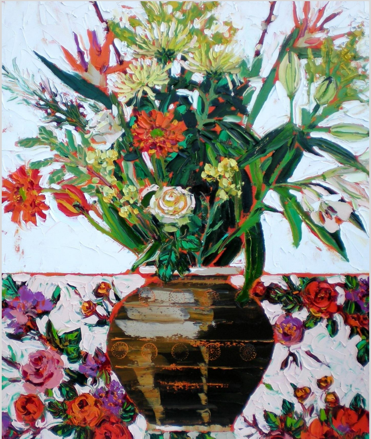
Flower arrangement 91 x 76 cm Oil on canvas