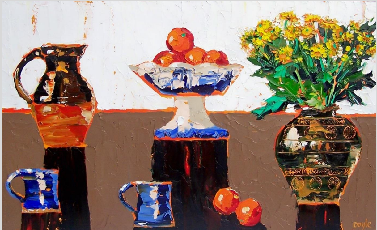
Still life with chrysanthemums 61 x 100 cm Oil on board