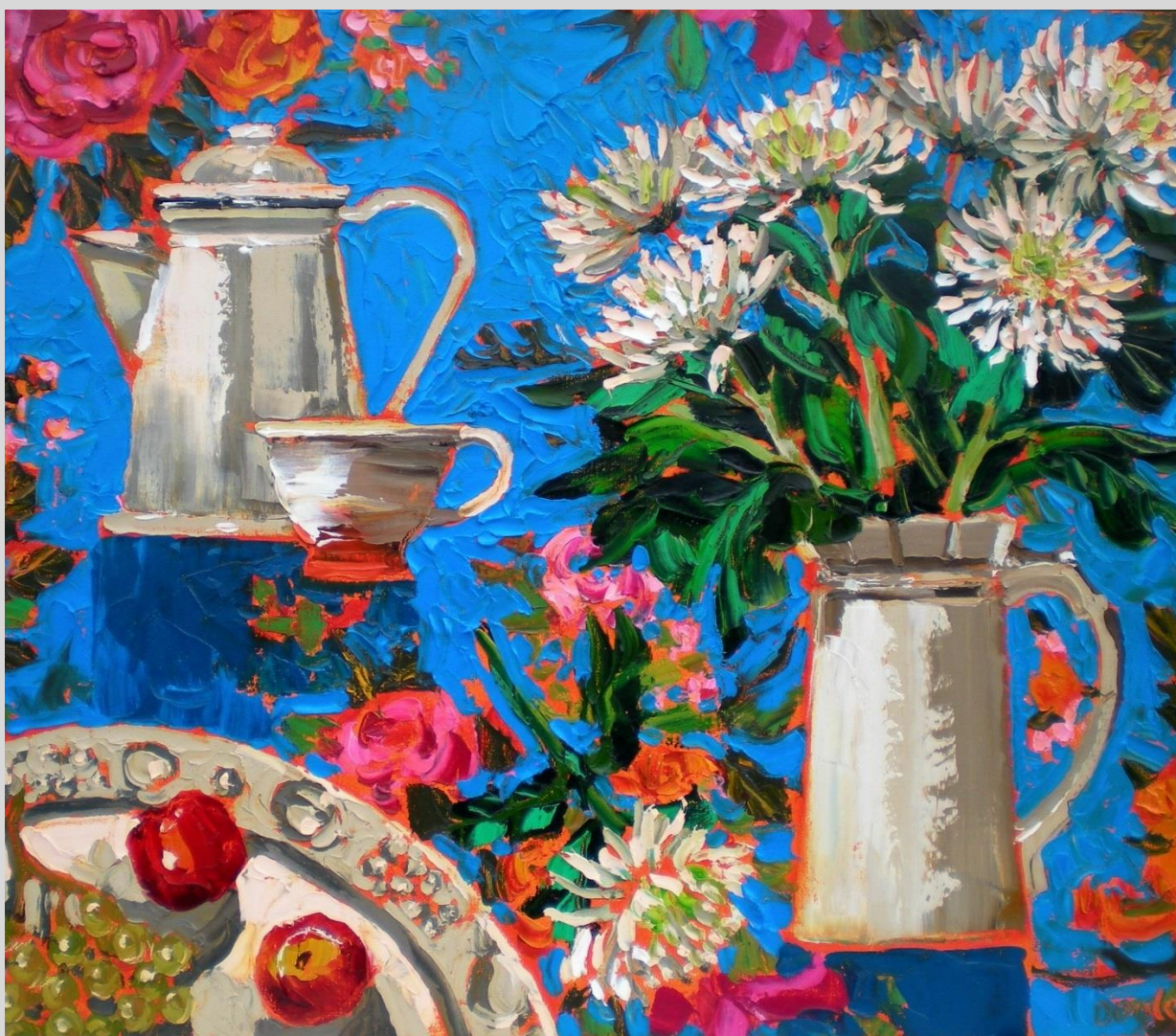
Still life with plums and chrysanthemums 61 x 71 cm Oil on canvas