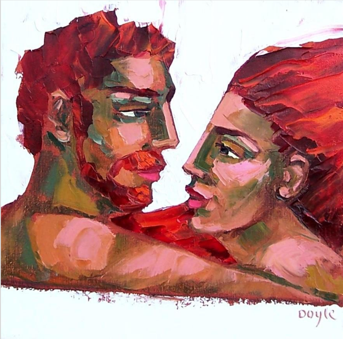
Lovers 46 x 46 cm Oil on canvas