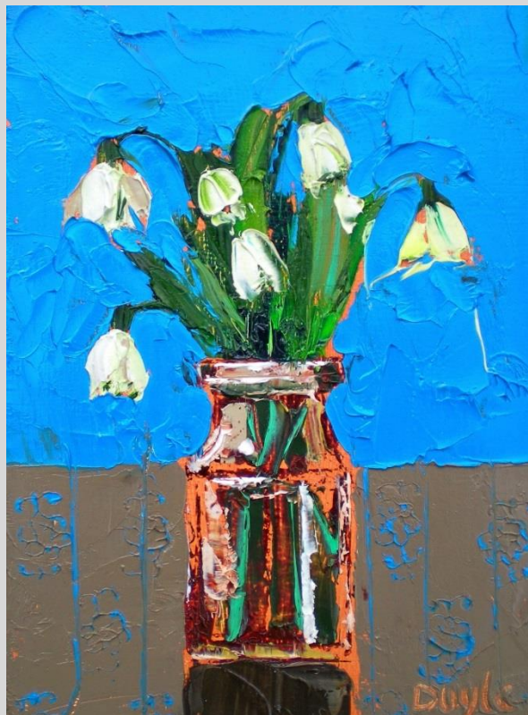
Snowdrops blue 20 x 15 cm Oil on board