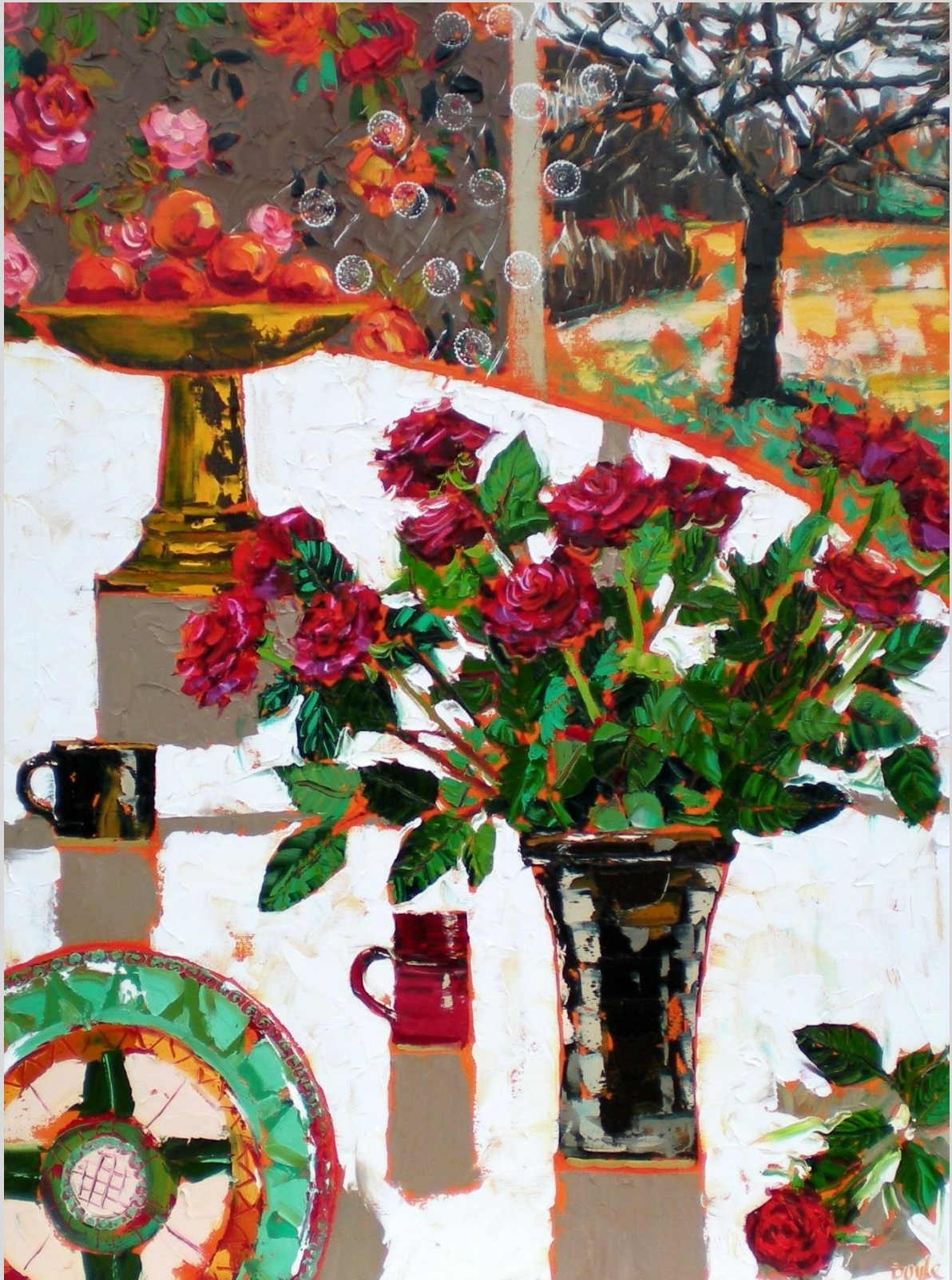
White interior 122 x 91 cm Oil on canvas