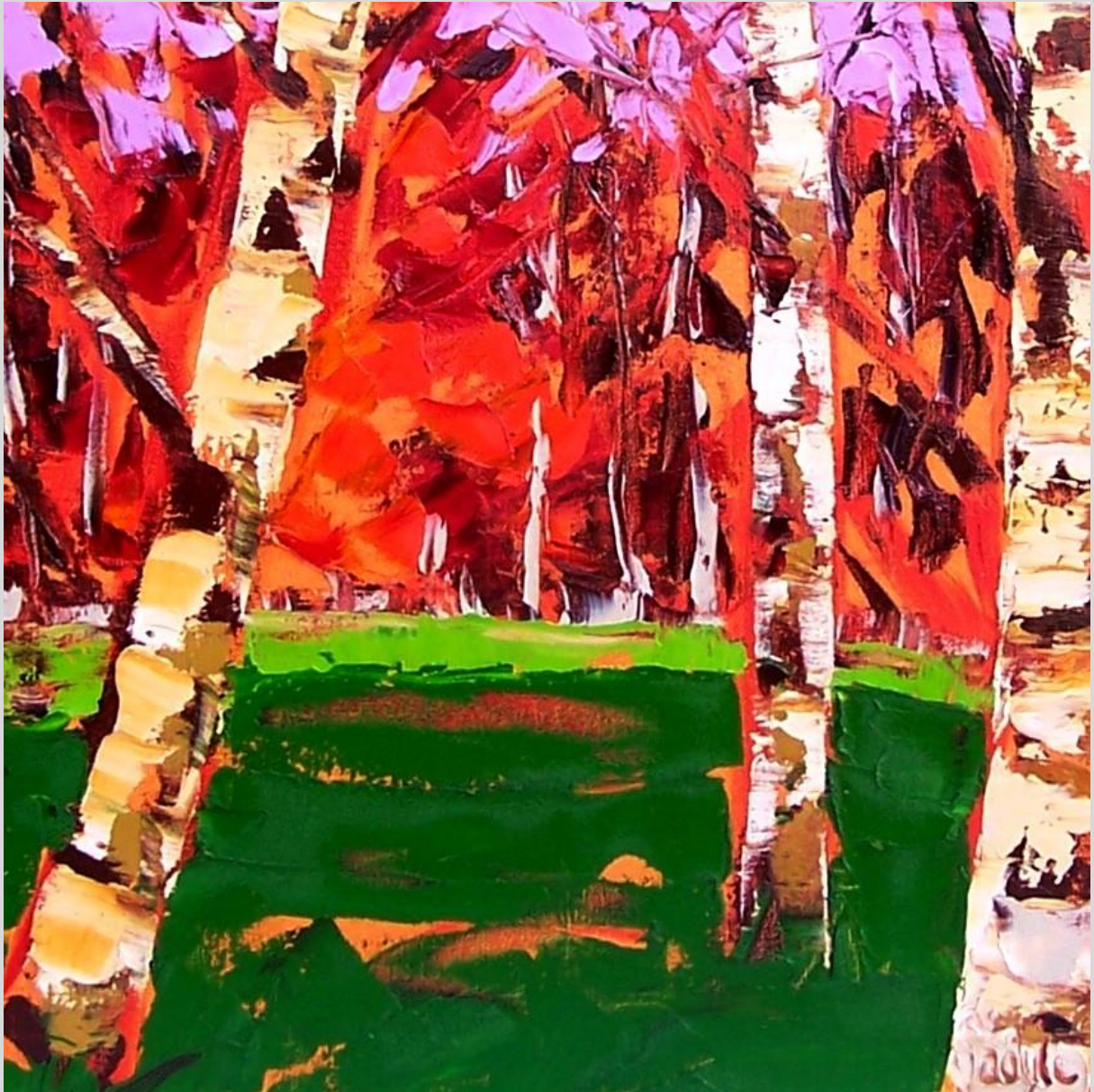
Birches 46 x 46 cm Oil on canvas