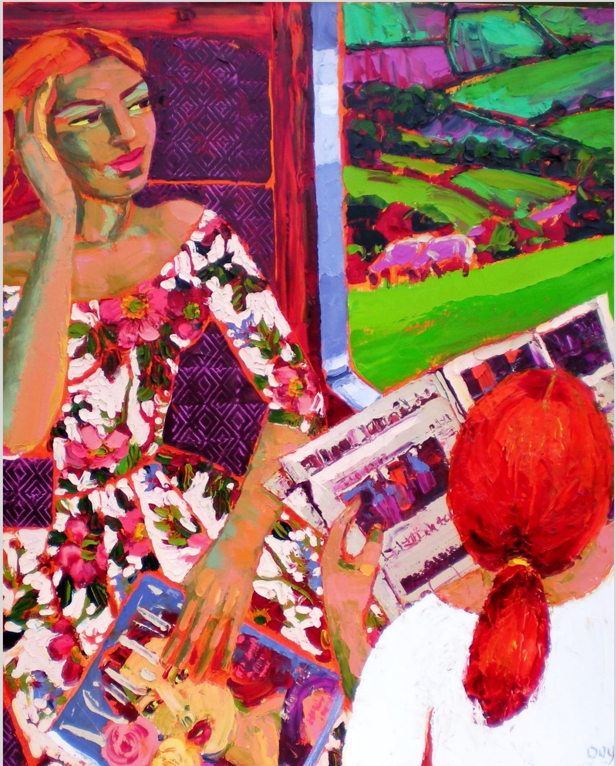
Returning home 91 x 76 cm Oil on canvas