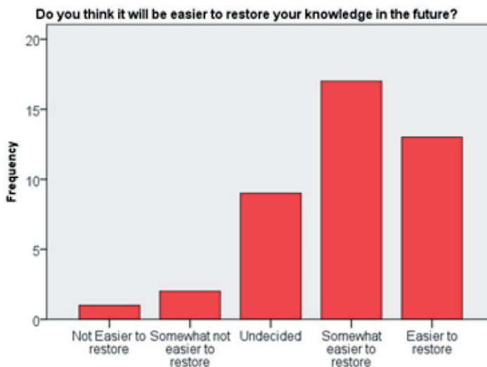
FIG. 1. Fourth-year students' responses on whether it will be easier to restore knowledge from diagnostic testing.

To see if the test is suitable for the ability level of our students we carried out a Rasch analysis on the test, i.e. if the mean difficulty level of the questions and the mean ability level of the students are well aligned.