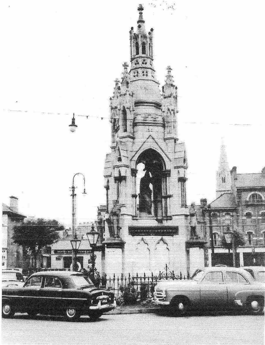
The National Monument, Grand Parade, Cork, courtesy of the National Library of Ireland.