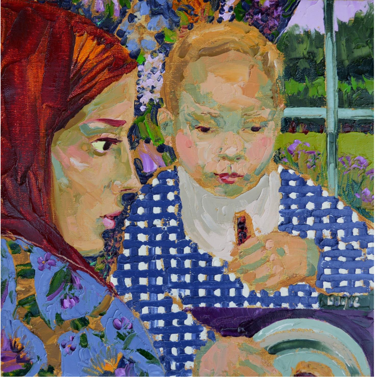
Mother and child II 40 x 40 cm Oil on canvas