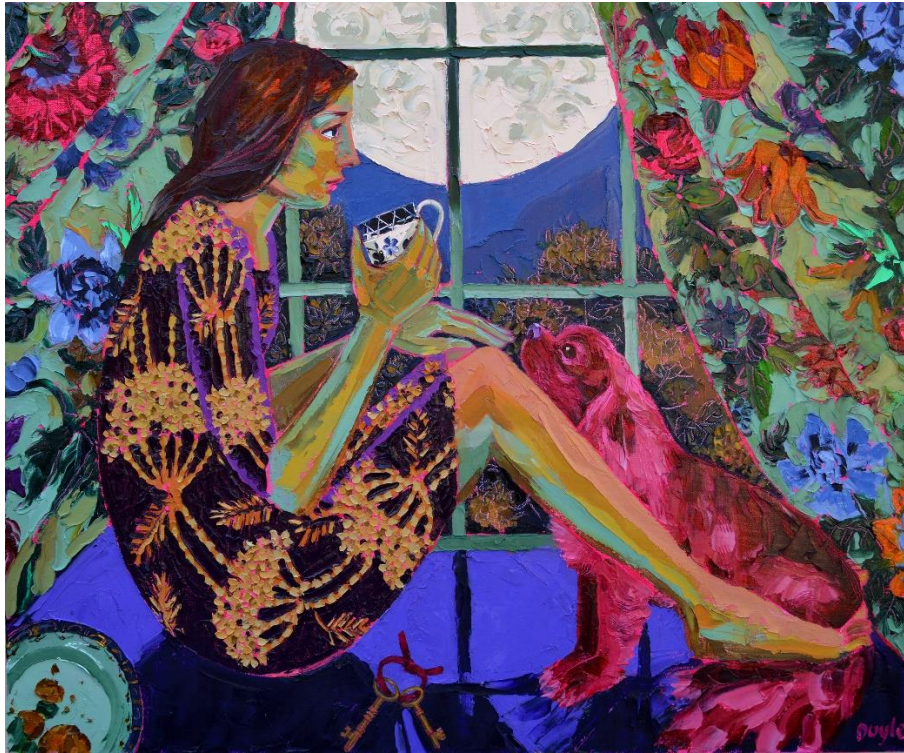
Pink moon 91 x 76 cm Oil on canvas