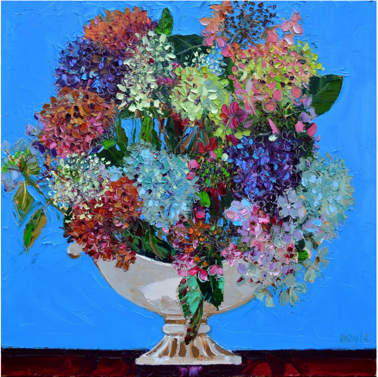
Ballyin hydrangeas 71 x 71 cm Oil on canvas