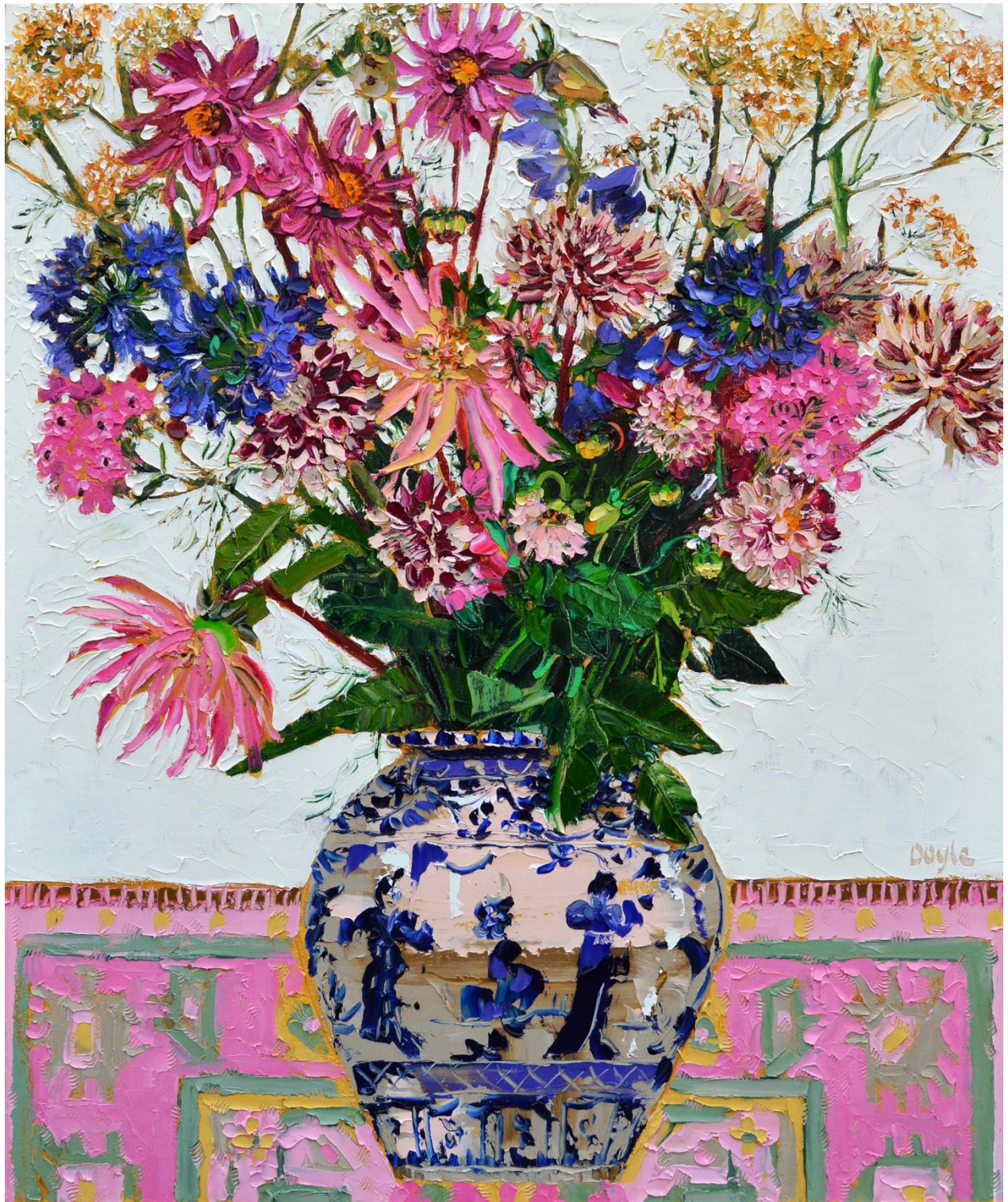
Summer garden flowers 91 x 76 cm Oil on canvas