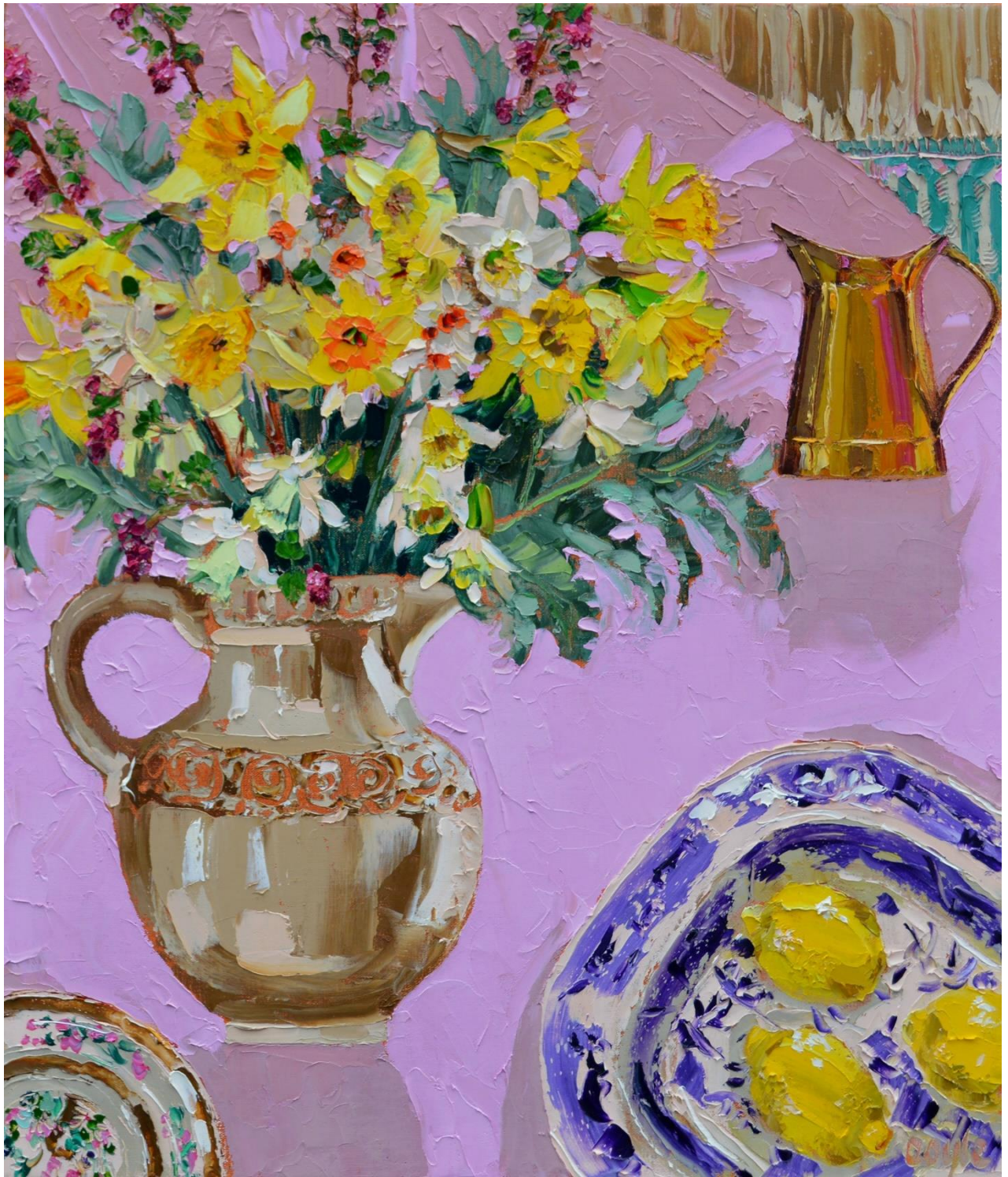
Daffodils and lemons 71 x 61cm Oil on canvas