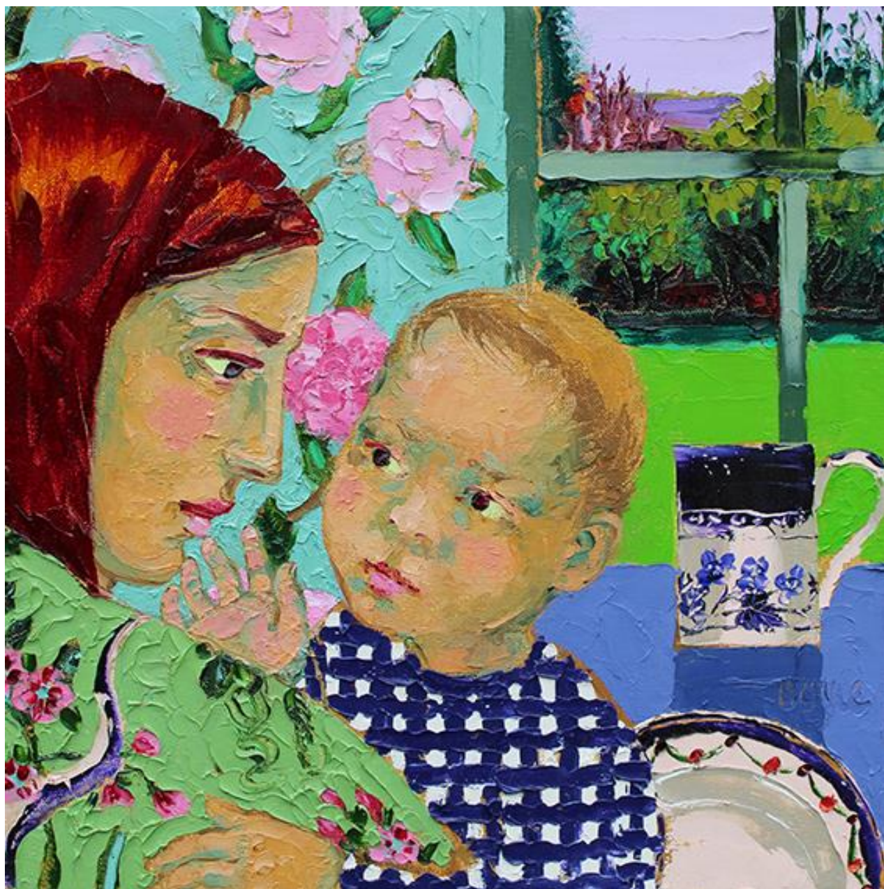
Mother and child 40 x 40 cm Oil on canvas