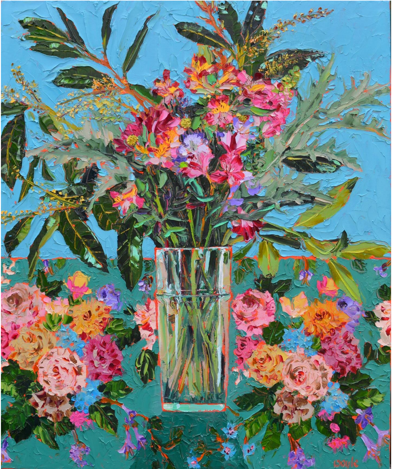
Viridian flowers 91 x 76 cm Oil on canvas