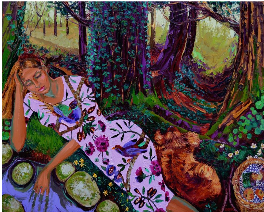
Woodland spring 122 x 152 cm Oil on canvas