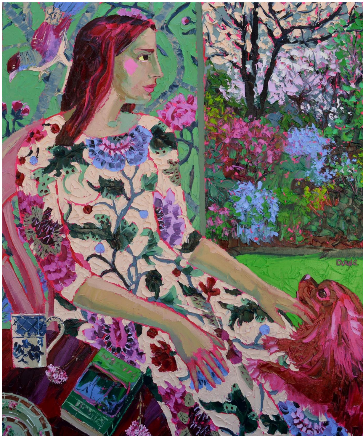
Blossom 91 x 76 cm Oil on canvas