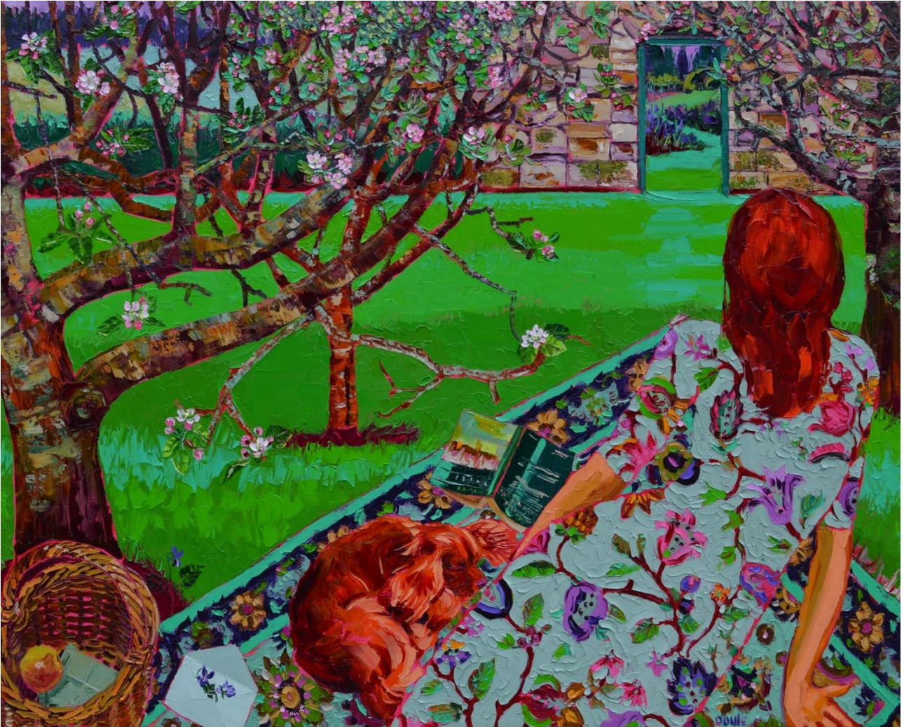
The orchard 122 x 152 cm Oil on canvas