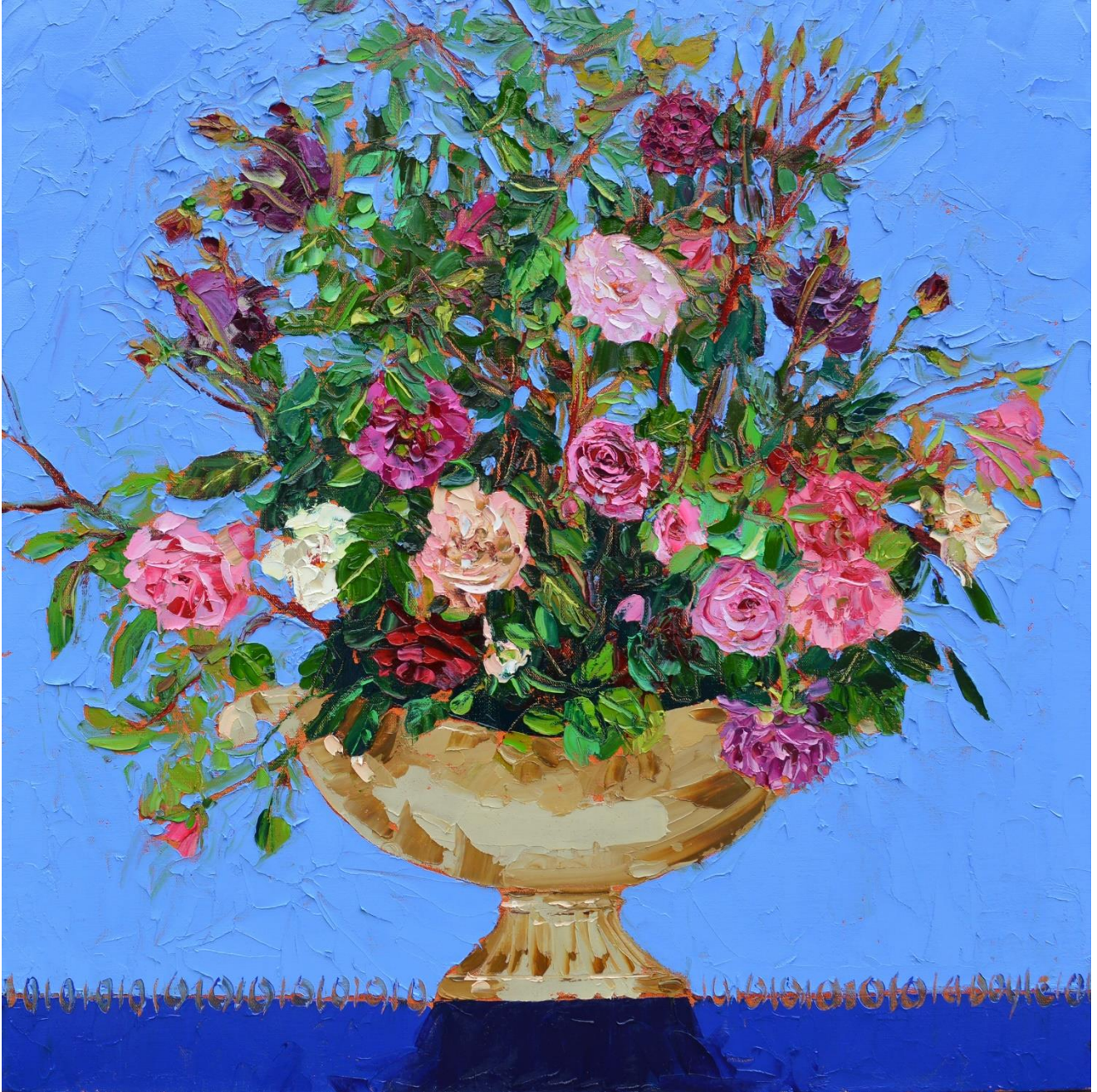
Ballyin roses 71 x 71 cm Oil on canvas