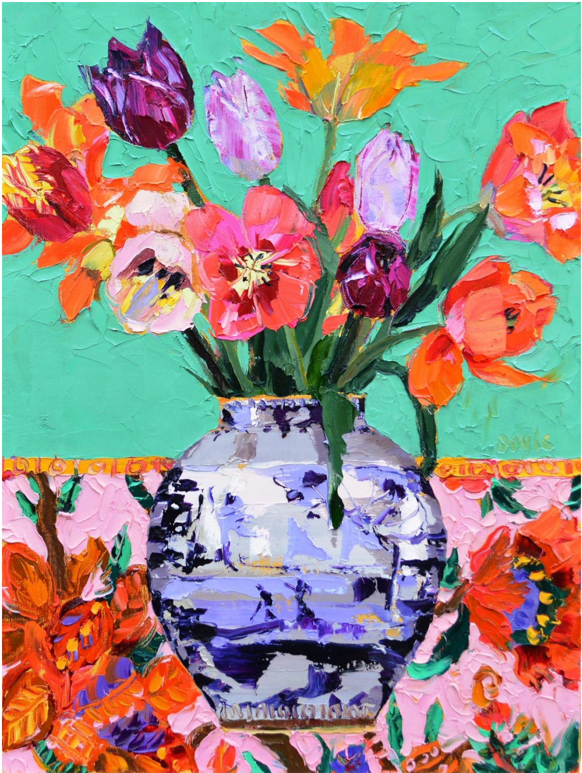
Tulips '20 61 x 46 cm Oil on canvas