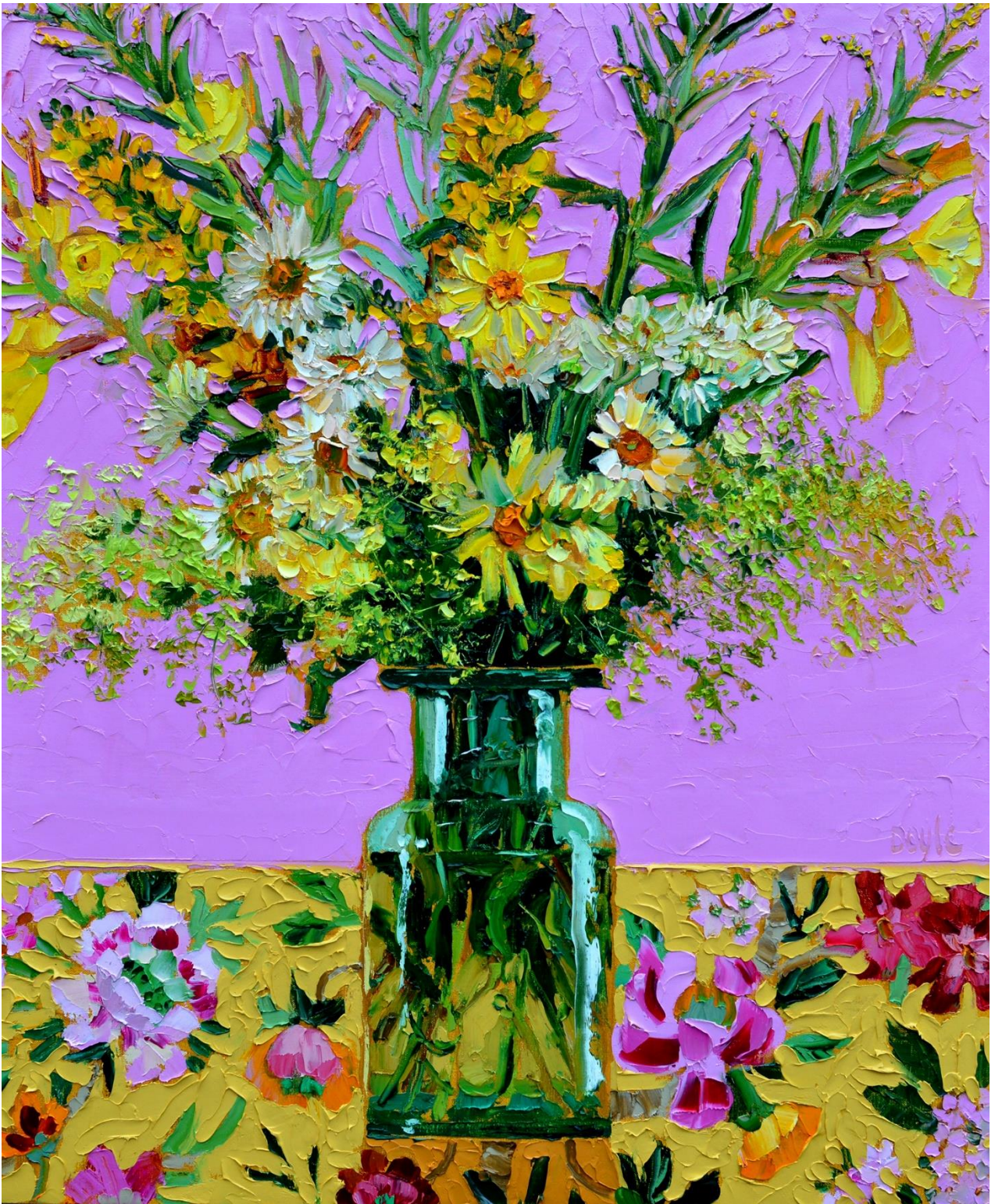
July flowers 91 x 76 cm Oil on canvas