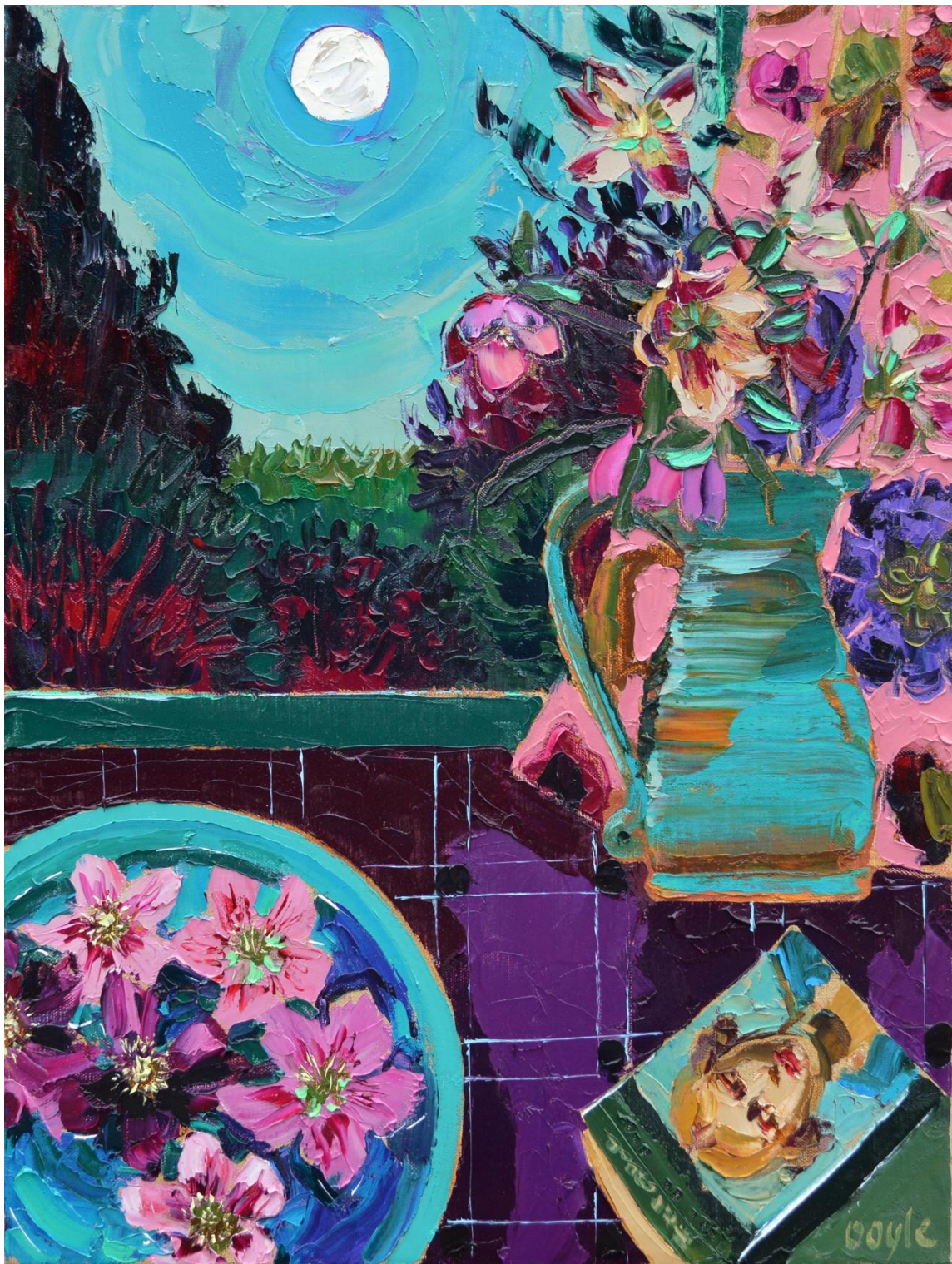
Hellebores 61 x 46 cm Oil on canvas