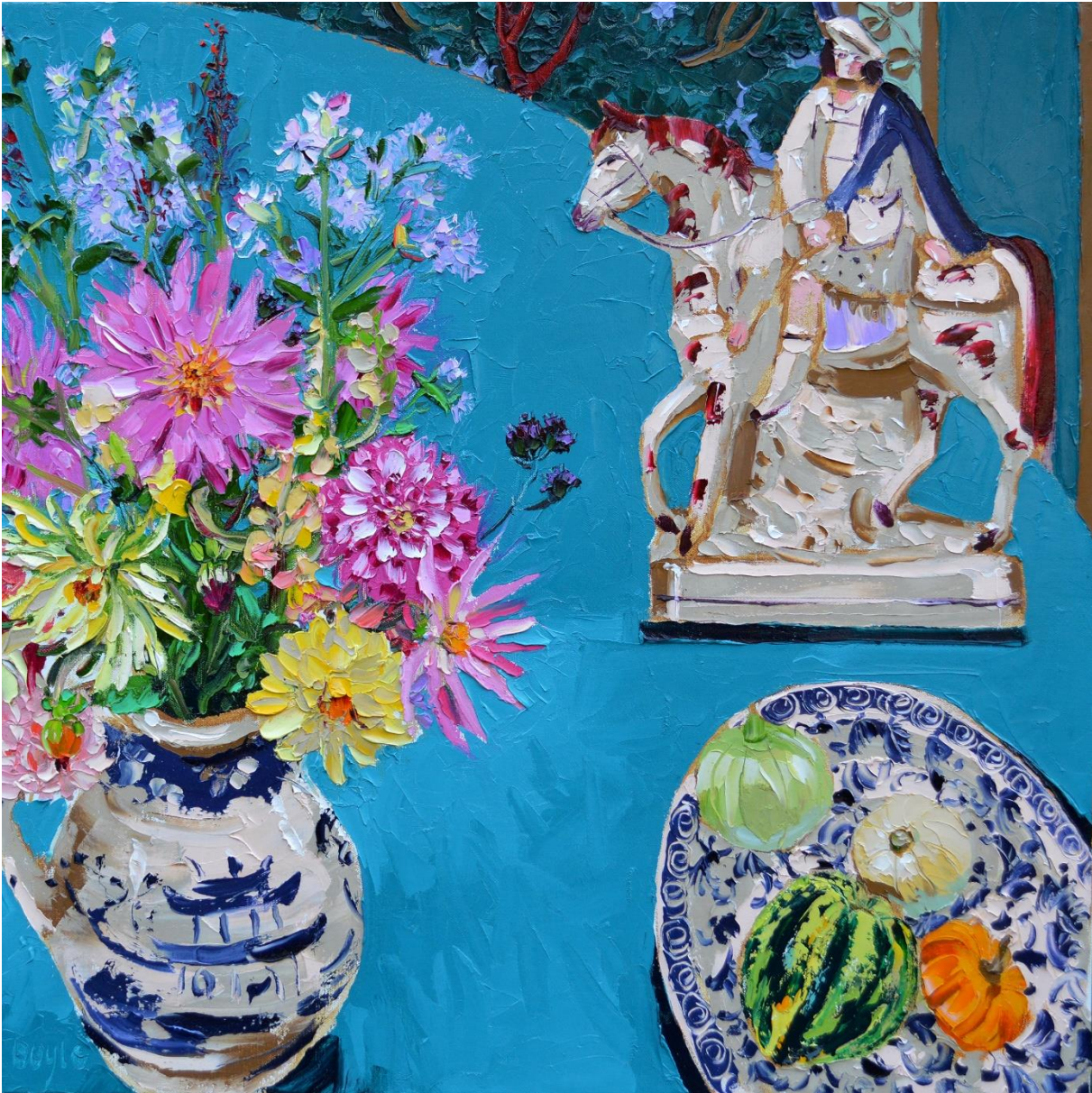
Still life with Staffordshire figure 71 x 71 cm Oil on canvas