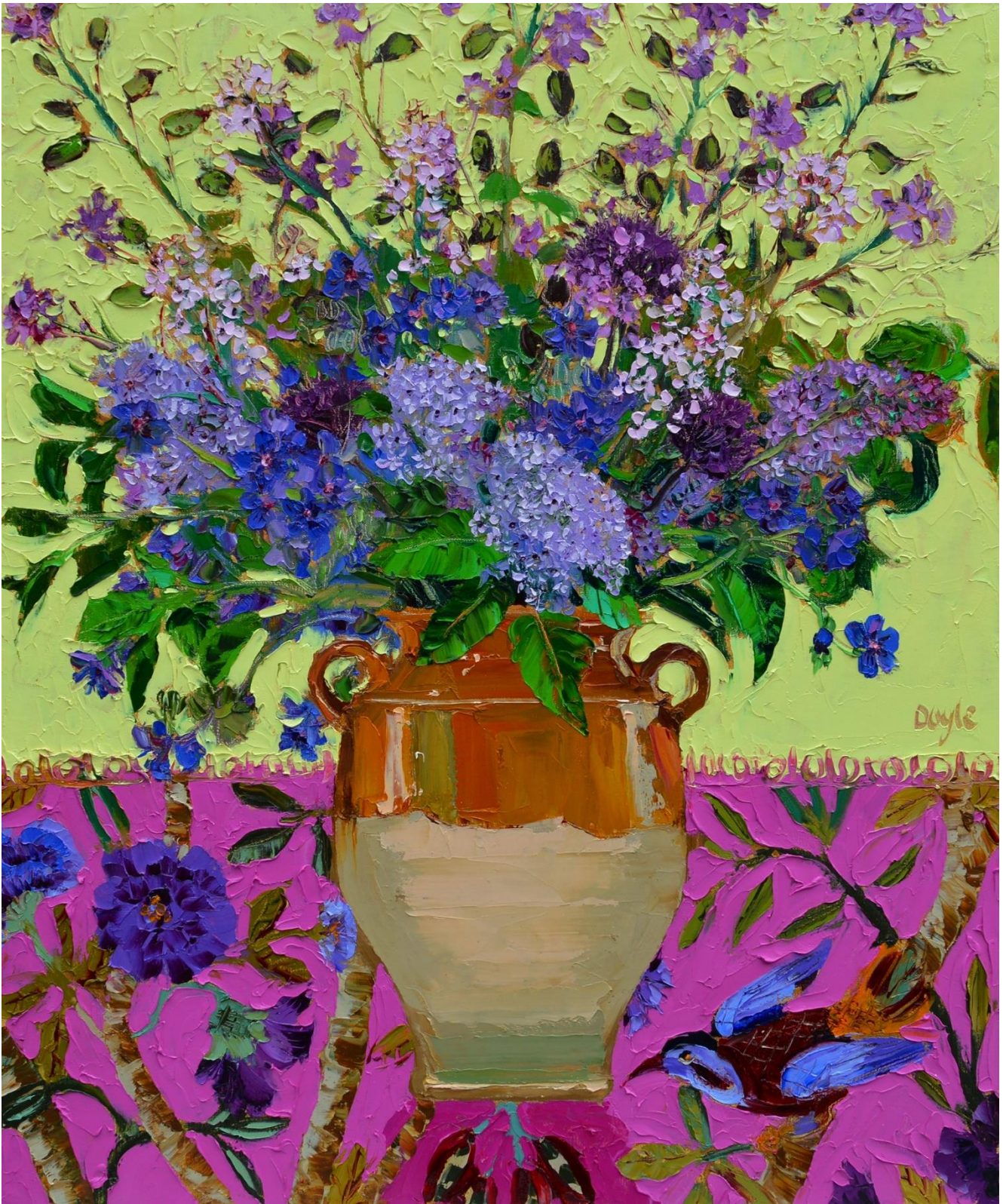
May flowers 91 x 76 cm Oil on canvas