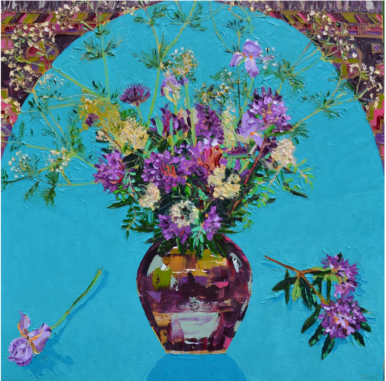
Flowers from the forest 122 x 122 cm Oil on canvas