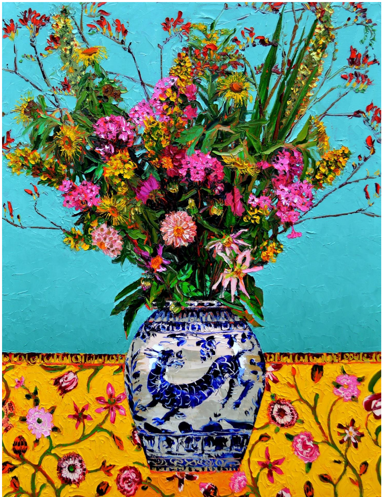
Summer garden arrangement 122 x 91 cm Oil on canvas