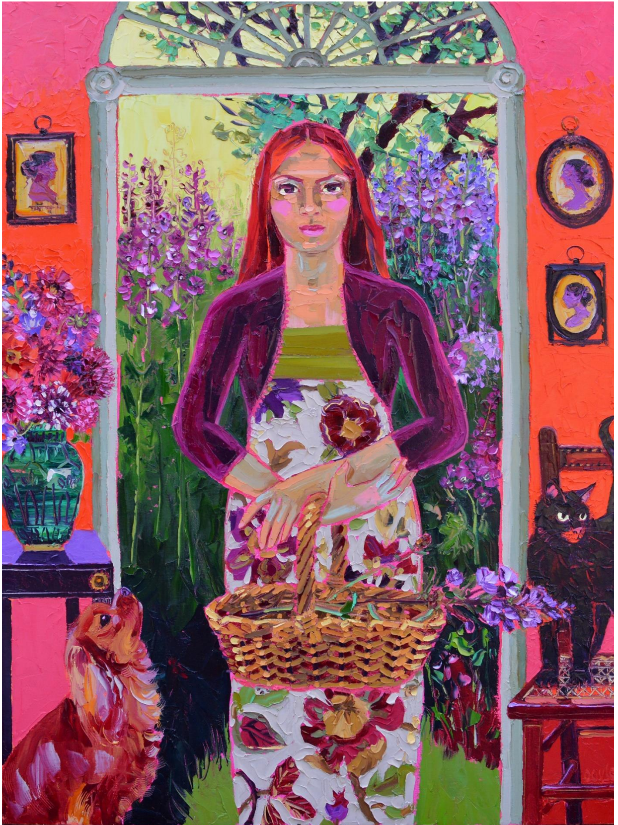
In from the garden 122 x 91 cm Oil on canvas