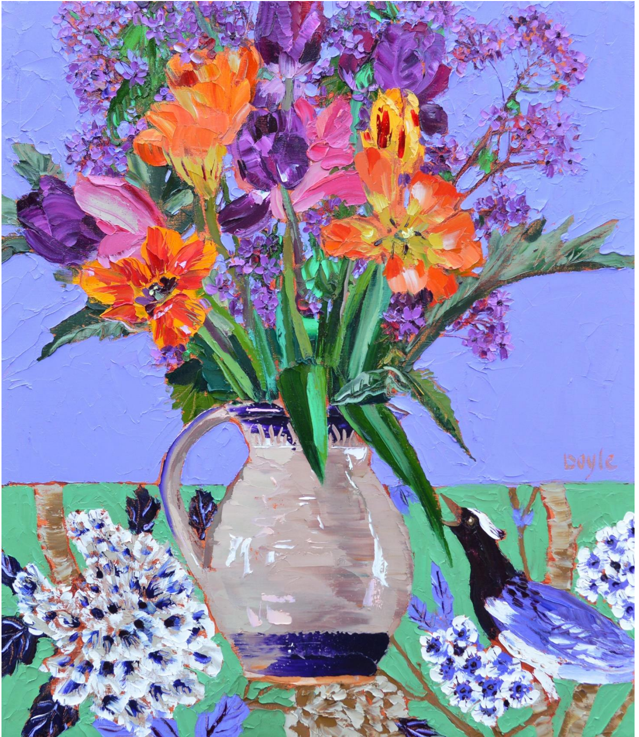
Tulips and honesty 71 x 61 cm Oil on canvas