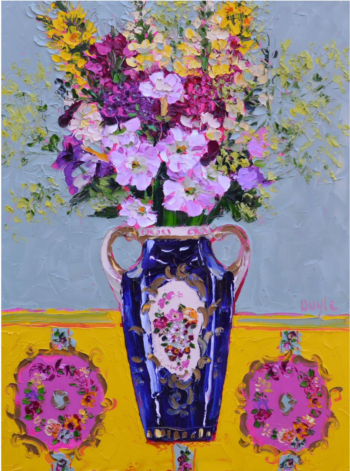
Petunias in blue vase 61 x 46 cm Oil on canvas