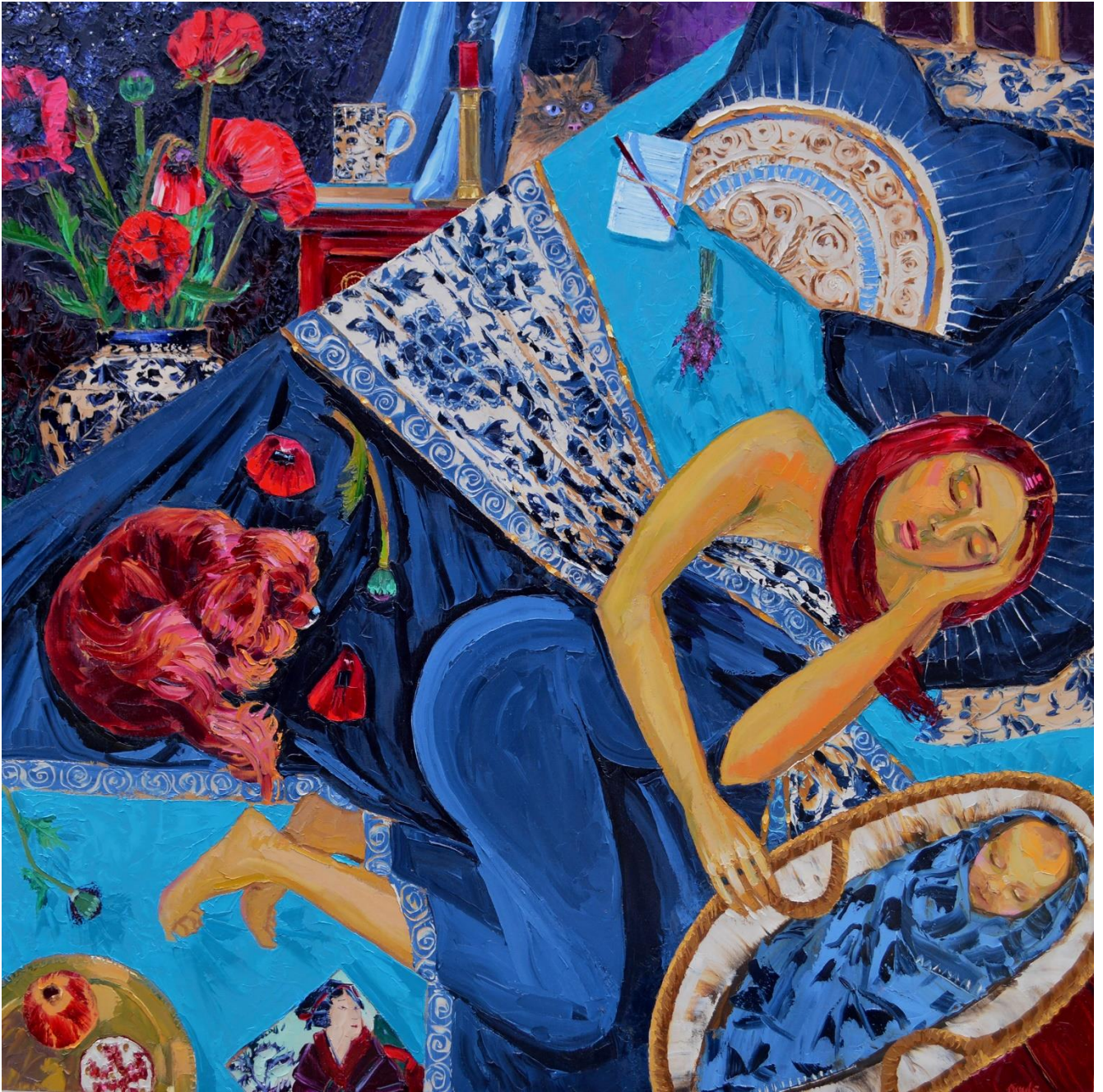
Above: Indigo sleep 152 x 152 cm Oil on canvas