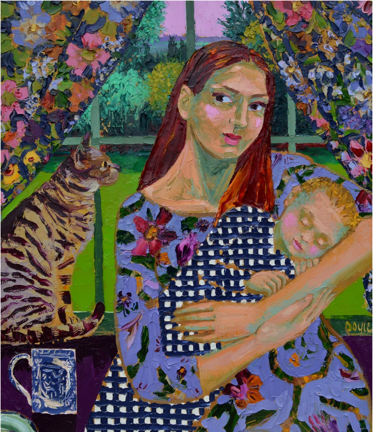
Lullaby 71 x 61 cm Oil on canvas