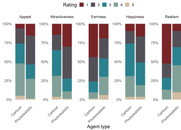
Figure 4: Average ratings of the traits that were rated significantly different based on agent type.

about the raft being useless. If a player had ranked the raft highly I think they would feel that the avatar was condescending”. Both these people were referring to an agent in the V_sF_n condition. Another participant in the same condition said they were “undecided whether [the agent was] deceitful or not knowledgeable”. These comments suggest that the audio-visual mismatch might have conveyed the impression that the agent was not expressing a positive emotion (as the face was neutral), but rather a negative emotion with high activation, such as sarcasm [see Mower et al. 2009].