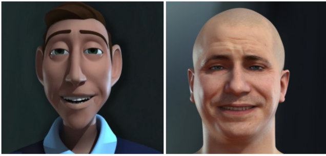
Figure 1: The (left) cartoon and (right) photorealistic agents with a smiling facial expression.

emotional activation (high excitation – low excitation) [Fagel 2006; Hanjalic 2006; Mower et al. 2009].