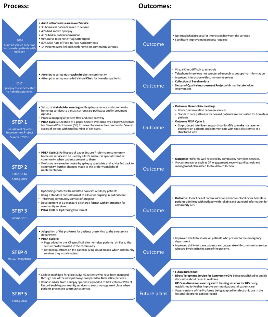
Figure 1 Timeline of processes and outcomes of our quality improvement project between 2016 to 2020. ICP, Integrated Care Pathway; PDSA, Plan-Do-Study-Act.

would be copied into the general discharge letter. Using the seizure pro forma to review homeless inpatients with seizures and communicating the outcomes to the community services we set up another PDSA cycle (PDSA 3) to try and optimise contact with community services for hospitalised patients.